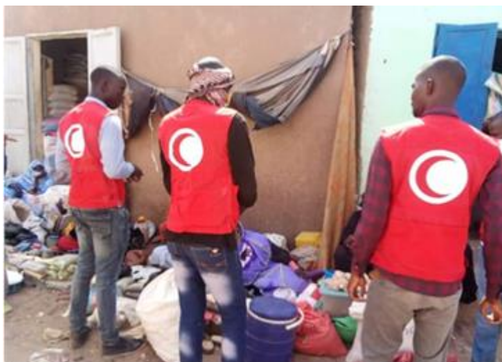
Volunteers mobilized to carry out market research in Bassiknou

According to primary and secondary data, approximately 9,282 people were affected by the floods and three (3) people died. Several families were left homeless due to collapsed homes and found refuge in host families, sheds, or other damaged houses. In addition, several farms were destroyed, and many herds of cattle decimated, causing a serious loss of livelihoods for the affected population.