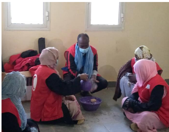
Training volunteers on hygiene promotion

Communication materials were developed to ensure the visibility of the National Society's action during all stages of the operation's implementation (press release, progress of activities, awareness-raising activities, etc.). It should also be noted that, as part of this operation, visibility equipment was provided to the mobilized volunteers (bibs, t-shirt, etc.).