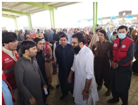
PRCS Team visiting Pak-Afghan border at Chaman on 27 August 2021.