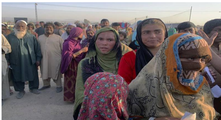
Displaced Afghan families gather to receive food distributed by an Islamabad-based Christian aid group on the outskirts of Chaman, a border town in Pakistan.

The decades-long conflict in Afghanistan has already resulted in a huge influx of Afghans into Pakistan seeking shelter, security, refuge, and livelihood, many of whom seek refuge in the country's main urban centres. Before the withdrawal of troops, the country was already hosting around 1.4 million registered Afghan nationals (recognized by the Government of Pakistan and UNHCR) and an estimated 1.4 million more unregistered and undocumented people from Afghanistan seeking refuge in Pakistan 6 . According to UNHCR latest Global Trends Report 2021, Pakistan was hosting the 4 th largest population of Afghan nationals globally (estimated 1.4m) in 2011. With Afghanistan sharing the longest border with Pakistan, the country has undergone a huge influx of Afghan people seeking refuge since 1980. Similarly, the temporarily displaced population from Swat and the then Federally Administered Tribal Areas (FATA) remained another challenge from 2007 till 2014 for Pakistan, which affected the socio-economic situation in the country. With the U.S evacuation completed and the Kabul airport now under Taliban control 7 , an increase of activity is expected on the borders through both formal and informal border crossing points, further exacerbating the already overwhelming situation.