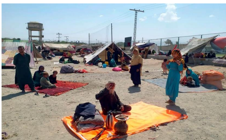
Afghan families sit outside their tents in an open area on the outskirts of Chaman, a border town in Pakistan

In recent months, there has been a considerable decline in the already fragile security and human rights situation across the country. According to UNHCR, as of 29 August 2021, over 570,000 Afghans are estimated to have been internally displaced since the start of the year (2021), out of which 80 per cent are women and children 2 . These circumstances have increased humanitarian needs and assistance to internally displaced people (TDPs) and triggered a new wave of cross-border displacement to neighbouring countries (primarily Pakistan and Iran) of people seeking refuge and safety. With the situation evolving rapidly and remaining uncertain, over 515,000 additional people are anticipated to flee across the borders as asylum seekers and Afghan nationals 3 in the worst-case scenario. It is not possible to predict a timeframe for this movement at this time. This will depend on the level of influx beginning of September.