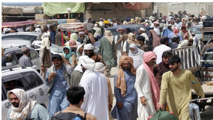
People arriving from Afghanistan gather at the Friendship Gate crossing point at the border town of Chaman, Pakistan.