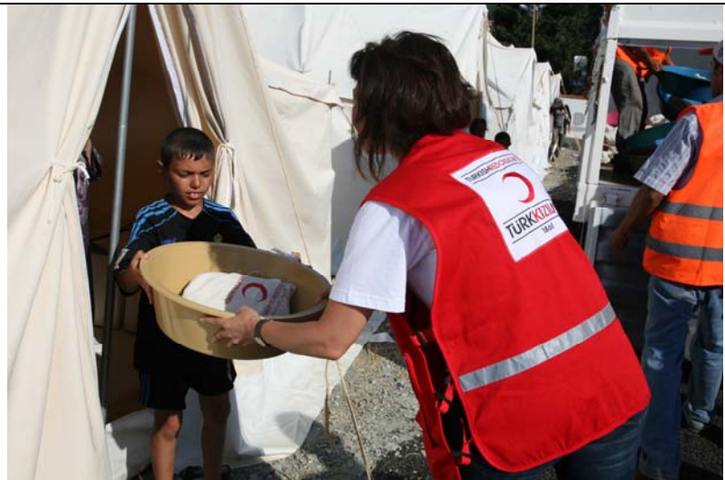
The Turkish Red Crescent continues to provide a variety of relief services in the protection camps. In the picture: distribution of non-food items.

Contributions are required to enable the Turkish Red Crescent (TRC) Society to help meet the needs of the most vulnerable people affected by the population movement in connection with the Syrian crisis.