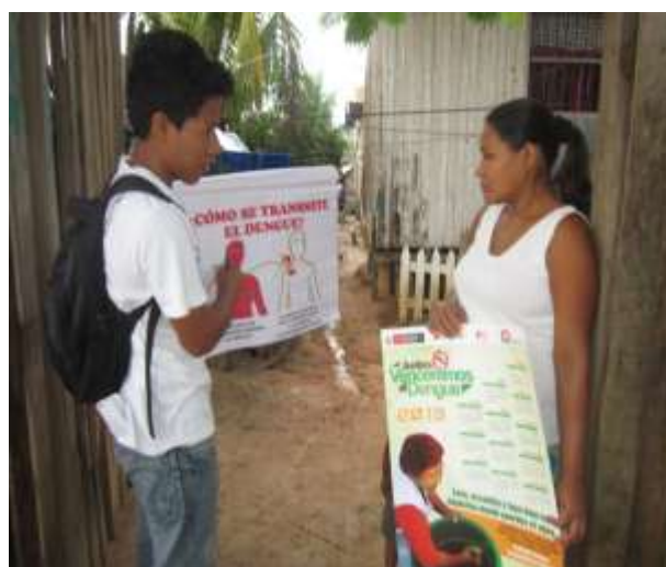
Peruvian Red Cross volunteers carry out awareness raising campaigns in the Manantay District (Ucayali).

Expecting an increase of the number of cases and with regional health capacity overwhelmed, the Peruvian Red Cross has launched an operation to reach up to 20,000 people with information on the disease and to provide treatment to 500 people, supporting the health authorities in the country.