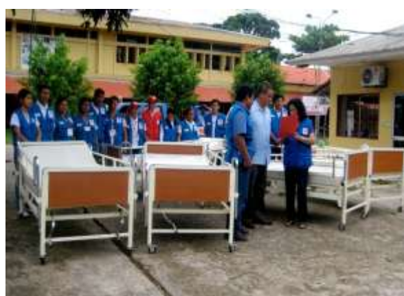
Peruvian Red Cross delivering the beds and tents to the hospital en Ucayali.

The selection of the health establishments was carried out considering the relationship between the high demand of patients with dengue and the facilities' capacity for attention. As a measure for the possible increase in cases, ten beds were left in the local subsidiary for whoever should need them.