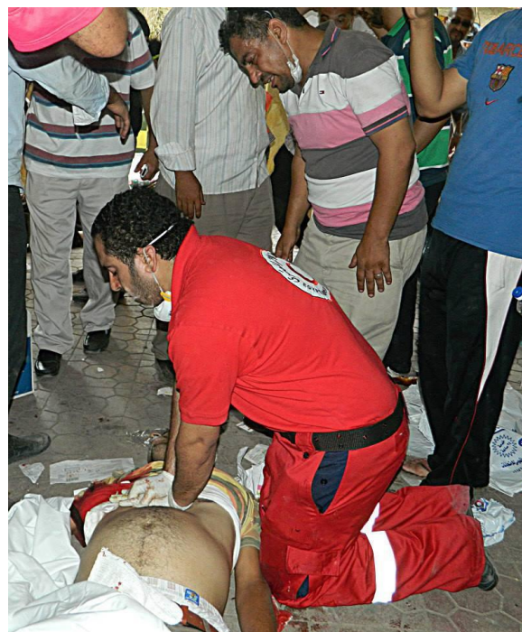
Emergency Action team volunteer of ERC providing First Aid rescue to an injured during the protests in Cairo

<click here for the DREF budget; here for contact details>