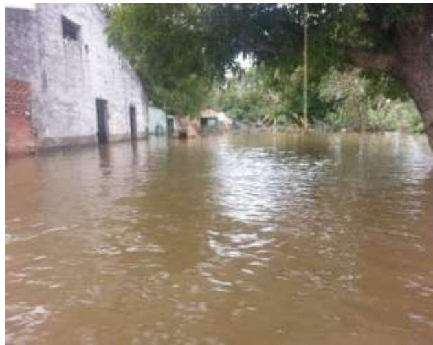
Several communities near the Paraná river have been flooded in the departments of Alto Paraná, Misiones, Itapúa, and Ñeembucú.

<click here for the DREF budget; here for contact details>