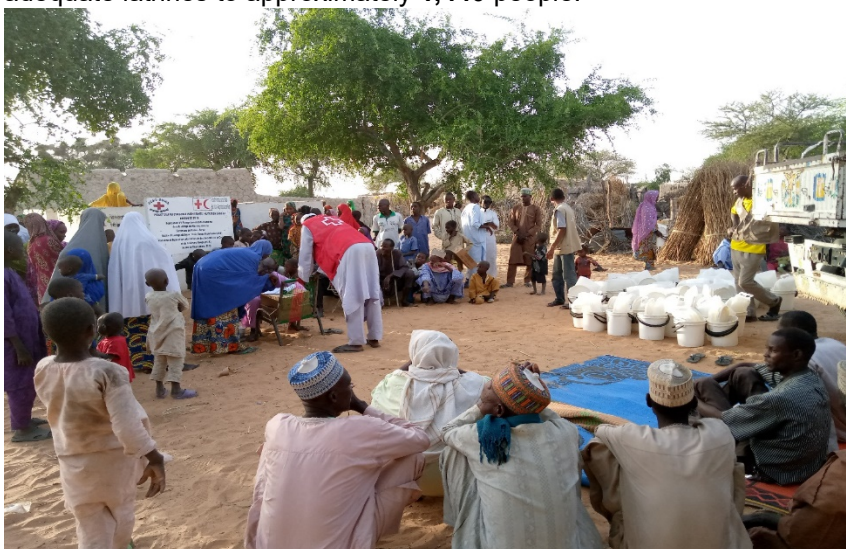
Household distribution operation