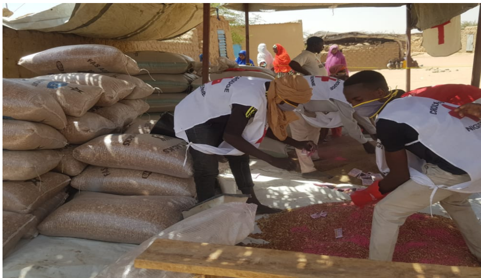
Niger red Cross Society volunteers treating Improved millet seed with fungicide before distribution