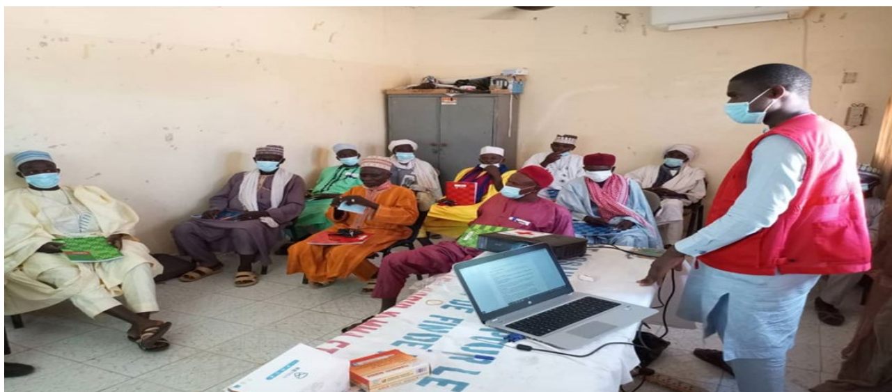
Training session on epidemics diseases to community leaders.