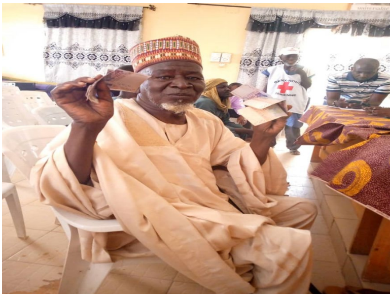
A beneficiary receiving cash assistance