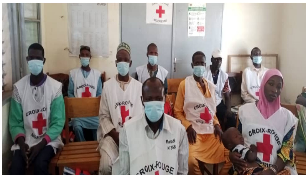
Volunteers attending training on how to support mothers' clubs