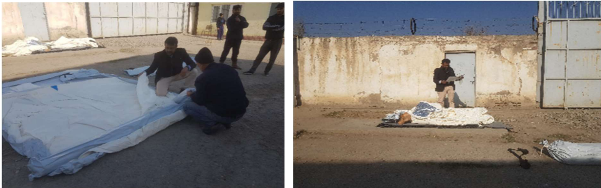
Images 2 &3: IFRC Shelter Rapid Response Delegate conducting a quality check of the winterised family tents and winter kits at the RCST Warehouse.

125 winterised family tents along with 125 winter kits for the IRCs purchased under the EA were received on December 6, 2021. The quality check was conducted by Shelter Rapid Response delegate.