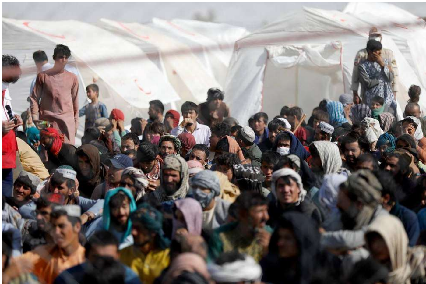
Figure 1: Iranian Red Crescent aid to Afghan refugees.

The Directorate General for European Civil Protection and Humanitarian Aid Operations (DG ECHO) in collaboration with the European Union (EU), presented the humanitarian implementation plan 2022 (HIP) for Iran. Furthermore, the European Union delegation from Brussels, as well as the Iranian Ministry of Foreign Affairs, paid a visit to the IRCS headquarters (MFA). The IFRC and IRCS presented the mandate and humanitarian value of IFRC/IRCS partnership on the Iranian landscape. The vaccination and status of Afghan refugees was also discussed.