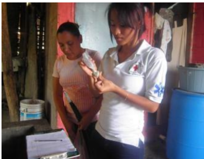
June 2013, the Honduran Red Cross carries out dengue prevention activities in the municipality of Villanueva – Cortes.

Dengue cases in Honduras until June 2013 exceed threefold the number of cases recorded during the same period on 2012. Among cities most affected by this outbreak are Tegucigalpa (located in the Department of Francisco Morazán) and San Pedro Sula (located in the Department of Cortés). To date, ten people have died from dengue and national authorities have confirmed 8,380 cases of dengue fever and 1,442 cases of hemorrhagic dengue fever. The Government of Honduras has issued a nationwide declaration of alert in 112 municipalities in response to this situation.