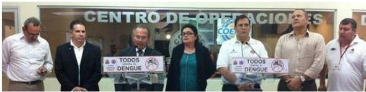
Declaration of National Alert by COPECO; the Honduran Red Cross has had participation in high level meetings and discussions on the dengue outbreak.

The Honduran Red Cross (HRC) is part of the National Risk Management System in Honduras. At the national level, it works on dengue incidence in coordination with authorities from the Permanent Contingency Commission (COPECO) and the Ministry of Health; at the local level, it does so with Municipal Health Centers and Municipal Emergency Committees.