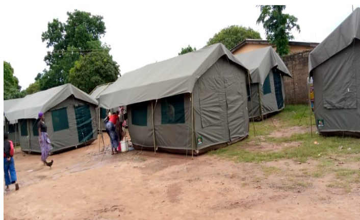
Tents distributed by DMMU to displaced families @ZRCS