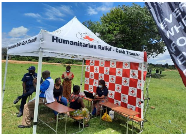
ZRCS cash transfer officer verifying beneficiaries' details during cash distribution

A total of 30 volunteers have been identified and trained in hygiene promotion, CBHFA and Covid 19 prevention. The 30 trained volunteers have been deployed in the camps and are conducting health promotion activities. A market assessment has been conducted at 2 big markets namely Nico and Chitongo in Namwala, to determine if these markets are still functioning after the disaster and are able to support the cash intervention ZRCS intends to implement. The assessment shows that these two markets are still accessible and basic commodities of the food basket are readily available with stable supply to be able to support the cash. Beneficiary identification, validation and sim card registration for the cash intervention to the 500 displaced HHs has commenced. ZRCS conducted a one-off cash transfer to 500 registered beneficiaries where each beneficiary received ZMW 500/month for 3 months bringing the total to ZMW1500/beneficiary which was distributed as a once off. ZRCS conducted cash distribution activity on the 20 th of February 2022.