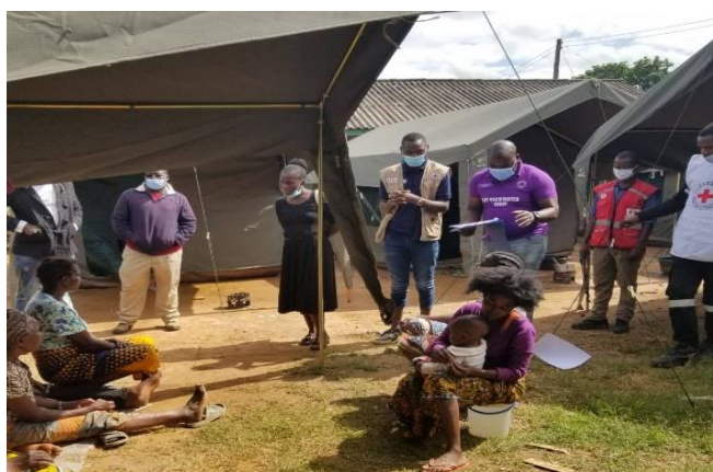
ZRCS team during needs assessment @ZRCS

The Zambia Red Cross Society and DMMU so far are the only two actors on the ground in Ndola district. ZRCS through its branch volunteers in Ndola have been part of a team that have been conducting assessments in the different affected areas from the onset of the floods. A team of ZRCS staff from HQ on 7 February,2022 conducted a rapid emergency needs assessment at the two camps that have been set up so far namely Mapalo and Twashuka area.