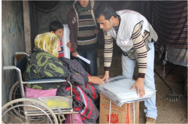
PRCS volunteer distributing stoves to the most vulnerable

The most affected areas were the most vulnerable ones: Bedouin communities and the communities living close to the barrier. A total of 3 people were directly killed by the rains (drowned), while 2 more indirectly. More than 642 families located in the districts of Gaza, Hebron, Jenin, Salfit, Ramallah, Tubas, Jordan Valley, Bani Naim, Yalta and the Jerusalem area beyond the barrier temporarily fled their houses due to floods and major damage to the infrastructure; in most cases they returned to their homes a few days after the rains stopped. The timely response by PRCS to the affected people contributed to mitigate the impact of the exceptionally heavy rains.