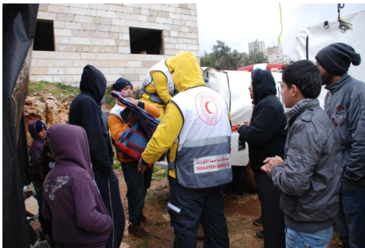
PRCS volunteer distributing winterization items to the most vulnerables.

The Federation, on behalf of the Palestine Red Crescent Society, wishes to thank the generous contributions done towards the replenishment of the DREF: the Netherlands Red Cross / Netherland's Government has contributed 52,939 CHF, and the Belgian Red Cross / Belgian Government 20,000 CHF to the DREF in replenishment of the allocation made for this operation.