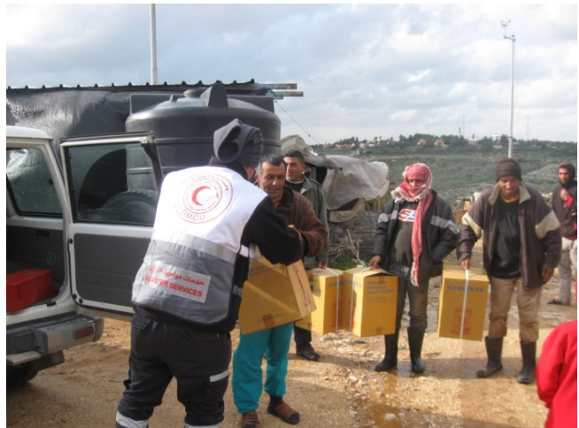
PRCS volunteer distributing stoves to the most vulnerable

99 families were evacuated by PRCS' NDRT teams in Jaba in Jenin district, Tulkarem, Tubas and Almasafer in Yatta and Bani Naim due to the insufficient capacity or movement restrictions for the Civil Defence.