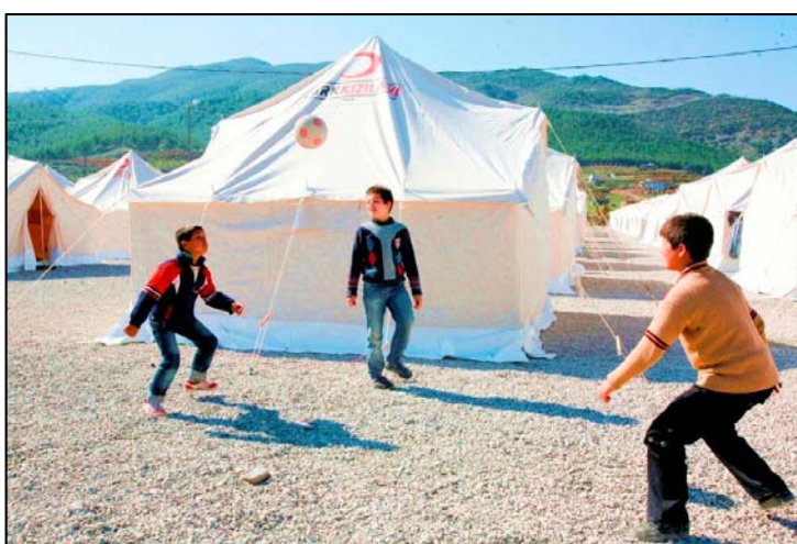
Half of the Syrian population in camps under protection of the Turkish Government are children.

The Turkish authorities have the overall responsibility for the coordination and management of the humanitarian assistance programme. These duties are assigned to the Turkish Disaster and Emergency Management Agency (AFAD) and the Turkish Ministry of Foreign Affairs. At the province level where the camps are located, the local AFAD bodies are working closely with the respective departments of the Turkish Ministry of Health and the Ministry of Education, security authorities and other relevant agencies. The TRC continues to work in close coordination with AFAD and in line with its assigned mandate and duties which consist of the procurement, delivery and distribution of essential relief supplies (shelter and other non-food items) and the organization of food supplies for the camp population.