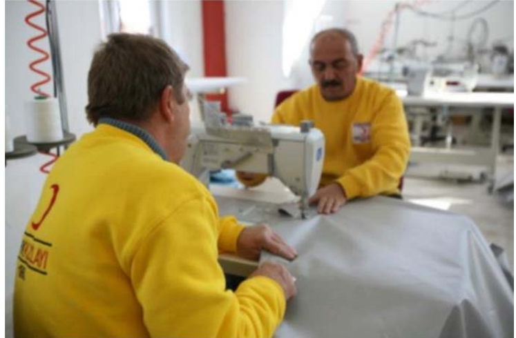
The TRC Shelter Systems Production Centre has built up its capacity for helping vulnerable people to cope with shelter needs after disasters. As a non-profit institution, the centre procures raw materials locally and keeps fabrication costs to a minimum to reduce the cost of shelter items.