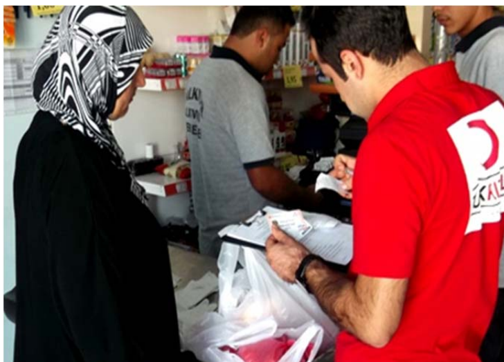
TRC personnel monitoring the use of the Kizilay Card by Syrian families living in camps. The card is part of a cash transfer programme for food in joint venture with WFP.

In addition to the existing provision and distribution of basic shelter and non-food items, hygiene and sanitation, a major additional component of the revised strategy is to assist the target population during the approaching harsh winter conditions experienced in south-eastern Turkey, where most of the camps are located. Various partners will continue to support the TRC in addressing other needs such as food, psychosocial activities, and remedial education. This revised Appeal is being issued concurrently with the revision and launch of the Syria Complex Emergency appeal (n° MDRSY003) and the regional population movement appeal for Iraq, Jordan, and Lebanon (n° MDR81003).