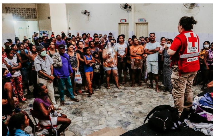
Community health talks, Bahia. March 2022.

During the first days of the operation in Bahia and Minas Gerais, first aid teams of three volunteers each were set up with first aid kits for the most urgent care. More than 200 people were attended to and the most common care provided were: cuts, wounds to feet and hands, dislocations, pressure and temperature controls. A total of 217 first-aid attentions have been provided to date, 90 to men and 127 to women.