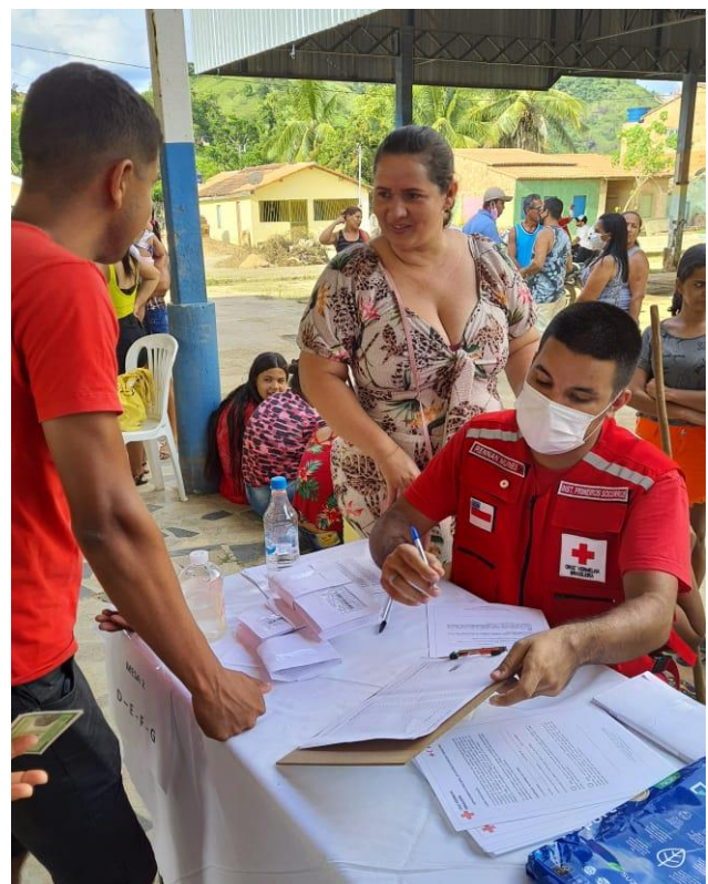
Delivery of CVA program, Bahia. March 2022.

The delivery in Bahia took place in a community hall and included training for people to use them correctly. In Minas Gerais the same process will be used, including the financial service provider. This activity is planned to be completed this week.