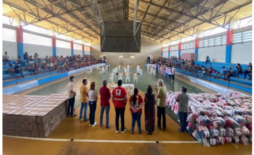
Delivery of water filters, Medeiros Neto, Bahia - April 2022

The rainy season in Brazil started a month ahead of schedule in early November 2021. Heavy precipitation, including the 7 December 2021 passage of a subtropical cyclone in Bahia, has led to floods and landslides in south-eastern Brazil. The Brazilian Red Cross (BRC) launched this DREF operation to respond to humanitarian needs in the Bahia state and, after more rainfall, it extended the operation to Minas Gerais. In mid-February and early March new rains affected additional areas of the country (Petrópolis, Angra dos Reis, Paraty).