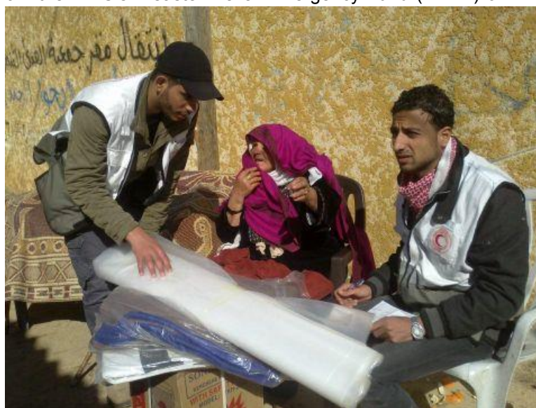
PRCS volunteers distributing plastic sheeting, tarpaulins and a heater to a family whose house was damaged by the intensive attacks. Caption: PRCS

240 volunteers as well as the PRCS staff of the EMS and the Hospitals were mobilized during the 8 days of heavy bombardments and shelling to save lives and provide emergency services to the victims of the conflict.