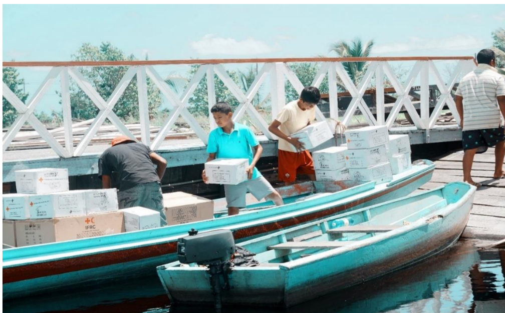
Photo 1: Distribution of shelter supplies in Mahaica Creek- Region 5, September 2021.