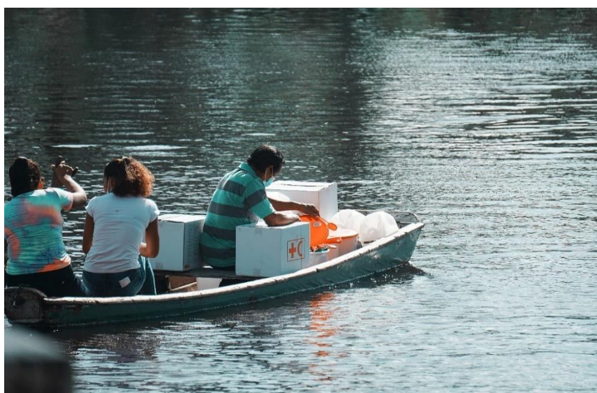
Photo 3: Distribution in Hururu, September 2021.

A total of 2,350 persons were reached with water sanitation and hygiene activities. 500 hygiene and cleaning kits and 870 buckets were distributed to affected persons identified through partnership with local stakeholders and our CDRT within the various communities. Distribution of 2 jerry cans per household and 20 packets of water purification tablets per household was conducted in 3 communities as follows: 100 households in Handsome Tree and Byaboo, 163 households in Hururu and 207 households in Landersville. In addition to receiving the jerry cans and tablets, each person was informed about the correct use of the tablets and received a leaflet with instructions on the proper use of the tablets.