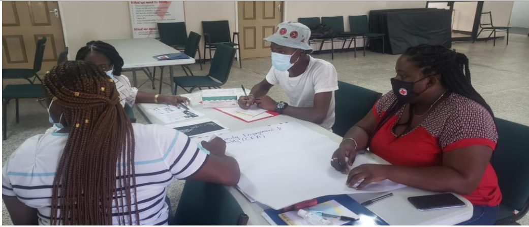
Photo 5: Community Engagement and Accountability Training at Guyana Red Cross Society Headquarters, September 2021.