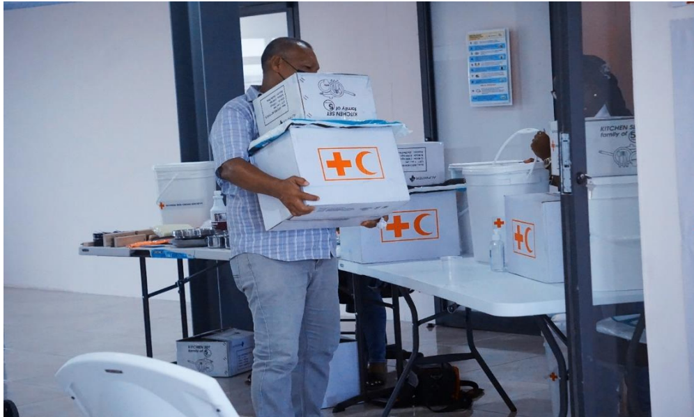
Photo 2: A member of the Bartica community collecting items at the National Society's distribution site, September 2021.

Mental Health Psychosocial Support Services Training for staff and 15 volunteers was completed on 25-26 September 2021.