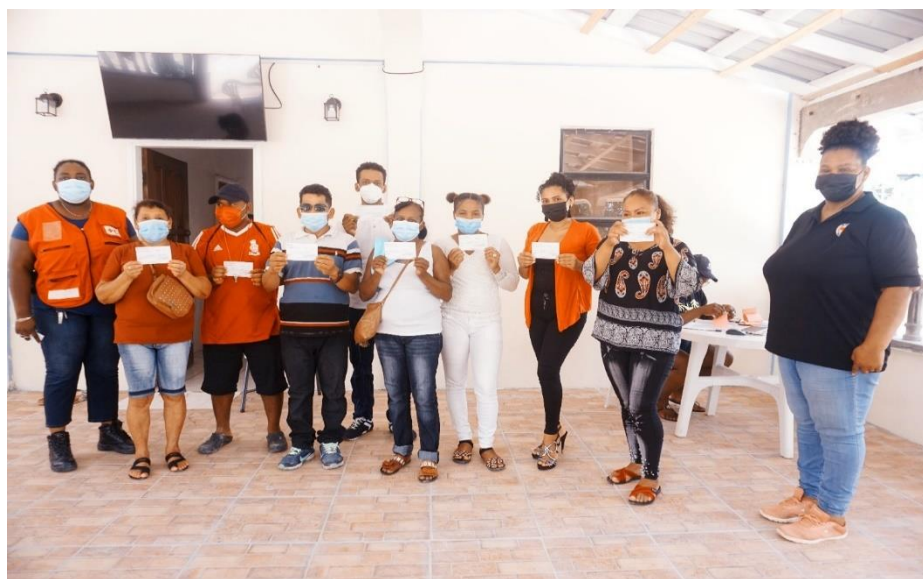
Photo 4: Community members of Landersville and Hururu receiving their vouchers, September 2021.

200 Multi-Sectoral Cash Vouchers were distributed across three communities in region 10. The communities identified for distribution were Kwakwani, Landersville and Hururu. The National Society created a selection criterion to identify the most vulnerable assisted. Continuous communication was done with the people reached to provide them with current and critical procedural updates.