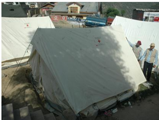
IRCS tents being set up in Doda district by Red Cross volunteers for earthquake affected families.

Summary: An earthquake with a 5.8 magnitude struck Jammu and Kashmir state on 1 May which caused severe damage to houses and other infrastructure in Doda and Kishtwar districts. Government reports as of 5 May confirmed 11,856 damaged houses and leaving at least an equal number of families in need of temporary shelter. The Indian Red Cross Society (IRCS) immediately mobilized relief supplies like tent and woollen blankets from its disaster preparedness (DP) stocks from Bahadurgarh warehouse near the capital city New Delhi. This operation is to enable prompt response for the earthquake affected areas through deployment of disaster response teams, support distribution and replenishment of the DP stocks.