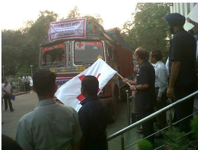
Relief supplies flagged off for Doda by Mr. Gulam Nabi Azad, Chairman of IRCS and Union Minister of Health and Family Welfare.

IRCS Jammu and Kashmir state branch worked very closely with the local authorities. Kishtwar district is up to 4,500 meters above sea level, and population is scattered which posted great challenge to reach the most vulnerable people. The Indian Red Cross Society has been coordinating closely with local government to optimize the use of available resources. IRCS is continually upholding the fundamental principles of the Movement as well as IFRC standards in respond to emergency in the country.