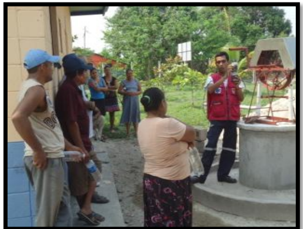
Volunteer provides training on the proper use of rehabilitated water wells.