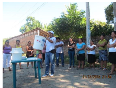
Volunteers providing talks on how to assemble, use and maintain water filters; Source: Salvadoran Red Cross.