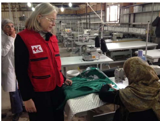
IFRC Europe Zone Director visited the handcraft workshops in Gaziantep aiming to improve the Syrian men and women's skills and offer them a source of income.