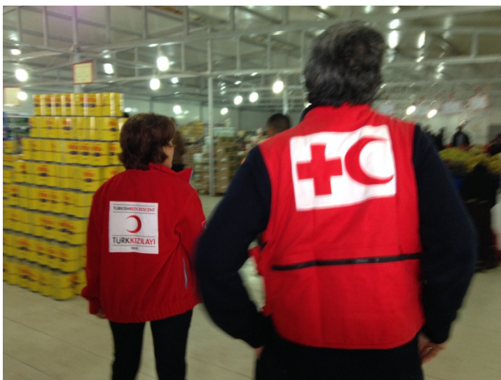
Turkish Red Crescent and IFRC cooperate in providing support to the protected Syrian population in Turkey. In the picture, a visit to food market in Nizip, where Turkish Red Crescent and WFP have a voucher program.

Appeal coverage: 78 % on the multilateral part, with an operating budget of CHF 18.3 million. The IFRC has been encouraging contributions both bilaterally (directly to the NS) and multilaterally (through the IFRC). However, the IFRC finance system is not designed to capture bilateral and national contributions towards the appeal. In order to deal with this problem, the second revision of the EA presented bilateral contributions separately, reducing the operational budget with the amount of bilateral contributions received to date. As a result the EA is at CHF 44.5 million, whereas the operating budget of the IFRC Secretariat is CHF 18.3 million only. The detailed financial report attached to the Operation Update comes in response to the operational budget and does not include the bilateral contributions directly provided to the Turkish Red Crescent.