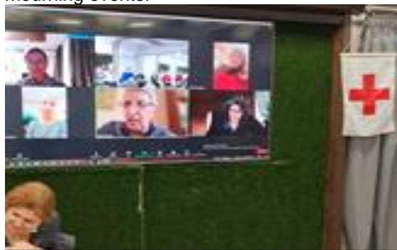
On-line consultations for MHPSS workers of Russian RC branch in Perm

The work has been implemented by the RRC through 18 PSS workers and 25 volunteers who were recruited and prepared to deliver the operation and provide MHPSS support. The RRC volunteers support PSS workers in identification of people in need of psychosocial support, collection and dissemination of information and during mass mourning events.