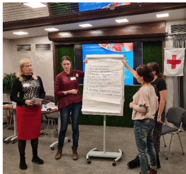
PSS workshop for Russian RC volunteers in Perm (October 2021).