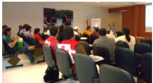
Members of the Red Cross participate in a meeting to coordinate their participation in the Filadelfia municipality.

In early February this year, an inter-agency agreement for mutual support has been signed between the government and the Boqueron branch; the agreement was approved and signed by the PRC departmental