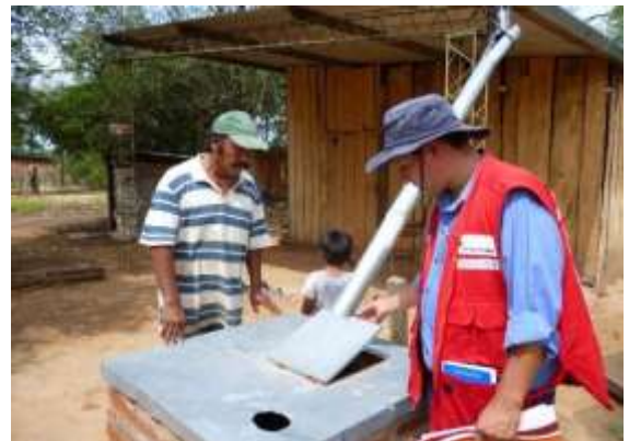
A technical member of the Paraguayan Red Cross assessed a "canelon" or rain water catchment system.

With the results of the new assessment, the number of water catchment systems to be repaired increased from 100 in the original appeal to 186 in this revision. However, only one new water catchment system will be installed in one community. This population will be trained in the adequate management and maintenance of the system. This community is the only one with fresh water in this area.