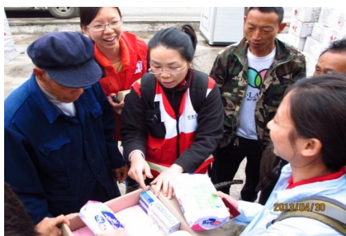
RCSC staff introducing the materials in the hygiene kits to beneficiaries in Longmen Township, Lushan County, 30 April 2013.

The 5,000 hygiene kits were procured and distributed as two batches. The first batch of 1,000 hygiene kits was distributed to 970 households in one village (same village where family/kitchen kits were distributed) of Longmen Township, Lushan County towards the end of April and May respectively. 30 households with more family members received two hygiene kits. RCSC Guangxi Relief ERT and local Red Cross branch coordinated this distribution process and conducted on-site monitoring as well as with the first batch distribution of family/kitchen kits.