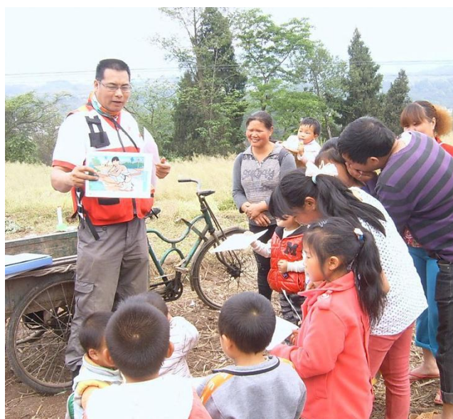
Yunnan branch mass sanitation ERT is conducting hygiene promotion to the relocated people.

Red Cross Society of China (RCSC) had sent a total of 25 emergency response teams (ERTs) with 400 team members and mobilized 113 relief vehicles to the affected areas for the emergency operation. These ERTs assisted in the distribution of food, drinking water, tents, quilts, umbrellas and other necessities to affected populations. Red Cross volunteers were also mobilized to participate in the provision of emergency medical services, relief supplies distribution, rescue operations, setting up of tents, providing psychological support and restoring family links.