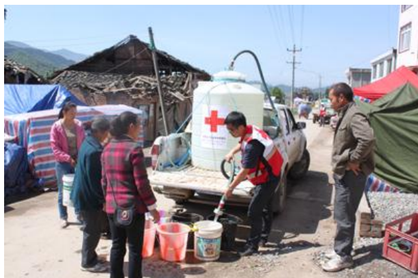
RCSC Hunan water ERT distributes clean water to local people in Lushan County.

treatment points. A total of 2,330 affected people received medical treatment from deployed RCSC medical response teams on the ground, whereby 62 people who were severely injured were transferred. Altogether, 4,474 houses were searched for live people. Two water treatment points had been set up and a total of 218 m 3 of safe water had been produced and distributed.