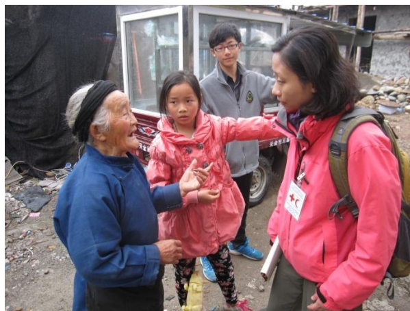
IFRC staff is interviewing an elderly lady in quake-hit Renjia Village of Lushan County, 24 April 2013.

In coordination with RCSC, IFRC has sent an operations coordinator from Asia Pacific disaster management unit to support field operations in April. IFRC East Asia regional delegation also supported and monitored RCSC's relief operations from the onset of the operation. It is coordinating with RCSC for the finalisation of recovery plans and would provide support as required. On 21 June, four IFRC staff from East Asia regional delegation staff went to Ya'an to provide training on 'Post-disaster Needs Assessment' for Red Cross and other volunteers. The training was facilitated through the network of non-profit organizations mentioned previously in the 'Coordination and Partnerships' section of this document.