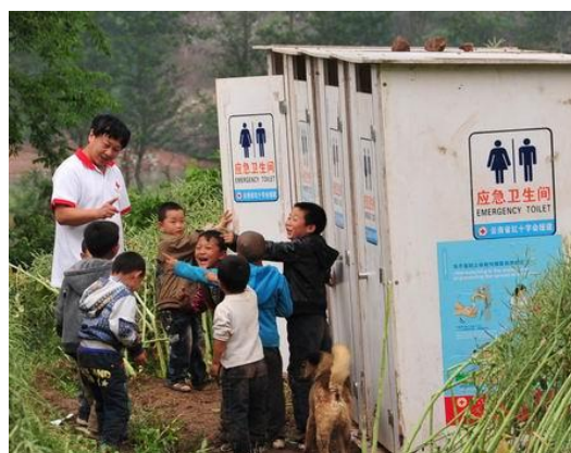
Yunnan branch mass sanitation ERT teaching children on hygiene awareness at the temporary latrines set up by the ERT.

At the same time, the ERT members trained nearly 100 Red Cross local volunteer leaders for hygiene promotion. The ERT members together with those volunteers conducted hygiene promotion to 15 villages and 25 resettlement points in five townships, reaching 1,200 beneficiaries. During the hygiene promotion exercise, they organized games for children, distributed IEC (information, education and communication) materials, organized local people to clean their neighbourhoods, and helped children to cut nails and taught children the correct way to wash hands. They encouraged people to adopt healthy behaviour changes such as not drinking tap water directly, not eating unclean/uncovered food, and washing hands before meals and after using latrines. Through building latrines and conducting hygiene promotion, the beneficiaries paid more attention to the sanitary situation around latrines. Used toilet papers, initially having been scattered here and there, were disposed into trash boxes in the latrines. The change of behaviour is a major contribution towards the prevention of infectious diseases