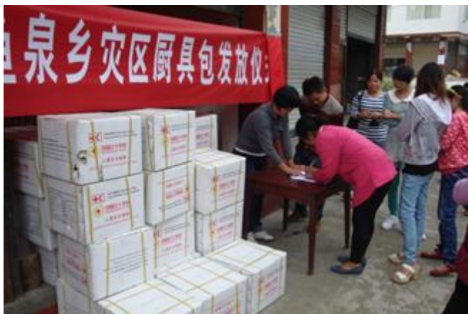
Beneficiaries are signing their names on the distribution form at the site of second batch of family/kitchen kits distribution, Yuquan Township, Tianquan County, Ya'an Prefecture September 12.

During the first ten days after the disaster, three staff of the IFRC was on the ground at the most-affected areas. One of them was a disaster response operations coordinator from the Asia Pacific zone office, to support the RCSC in performing needs assessments, operational planning, as well as coordination with other Movement partners.