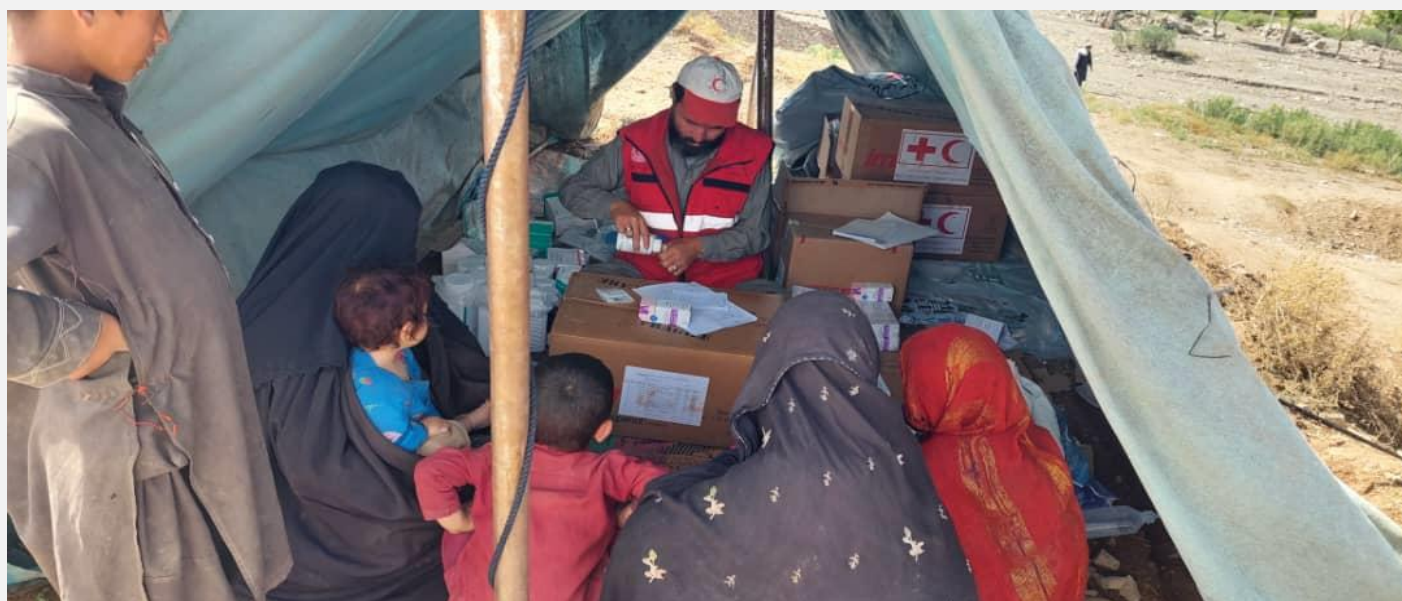
ARCS, supporting routine immunization and outpatient services through Mobile Health Teams

Emergency health and MHPSS: In addition to killing more than 1,000 people, the earthquake left more than 2,900 people injured. It also caused severe mental anguish, including to people with underlying psychosocial issues. To address immediate health needs, ARCS redirected various of its health teams – that were operational before the earthquake – to the affected areas. These comprised six MHTs in Paktika, six sub-health centres (SHCs) in Khost, and one basic healthcare centre (BHC) in Khost. The health teams are supported financially by the IFRC Secretariat and Norwegian Red Cross. Data on the collective number of people reached by these facilities are currently being collated. During the reporting period, the two MHTs operational in Paktika reached 10,225 people.