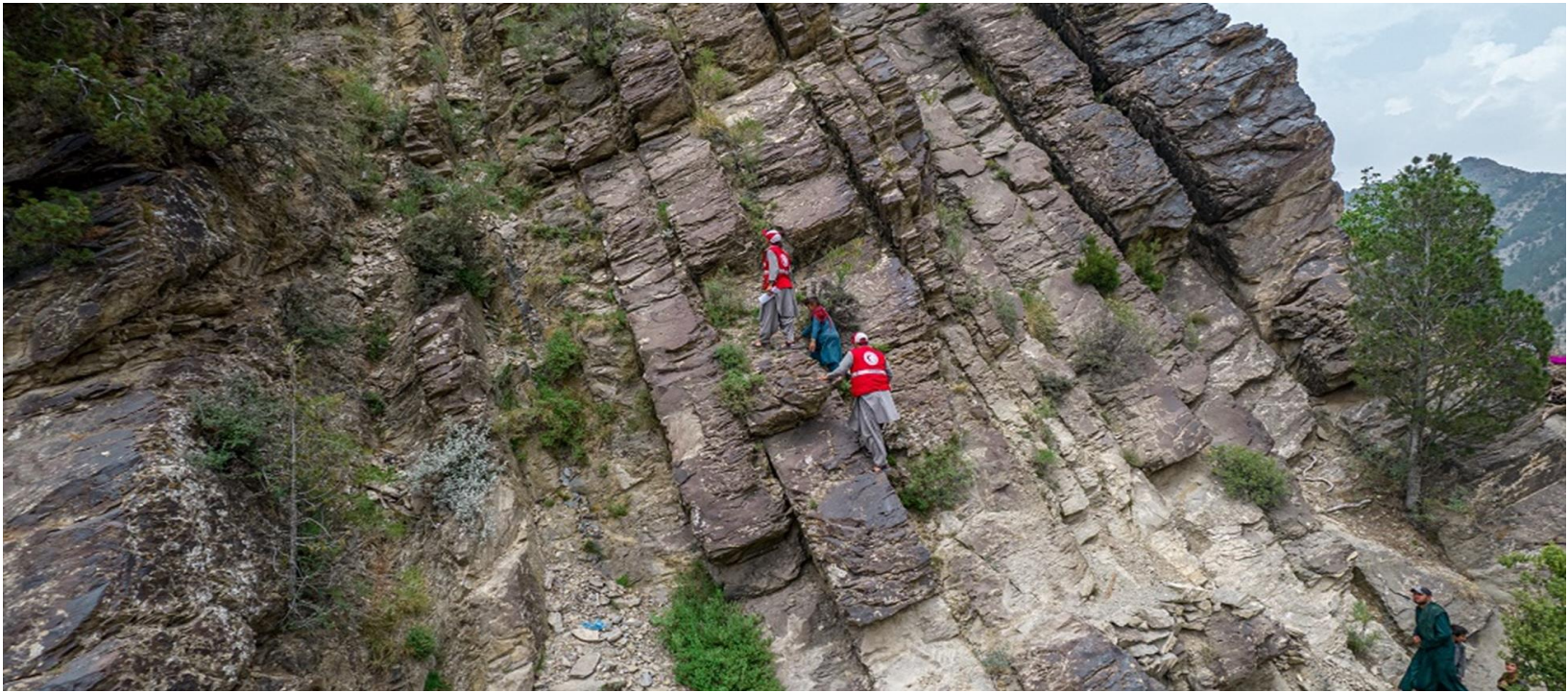
ARCS volunteers are doing their best to ensure that no affected household is left behind.