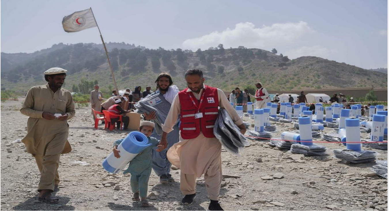
ARCS, with the support of IFRC, distributes NFI donated by JICA.