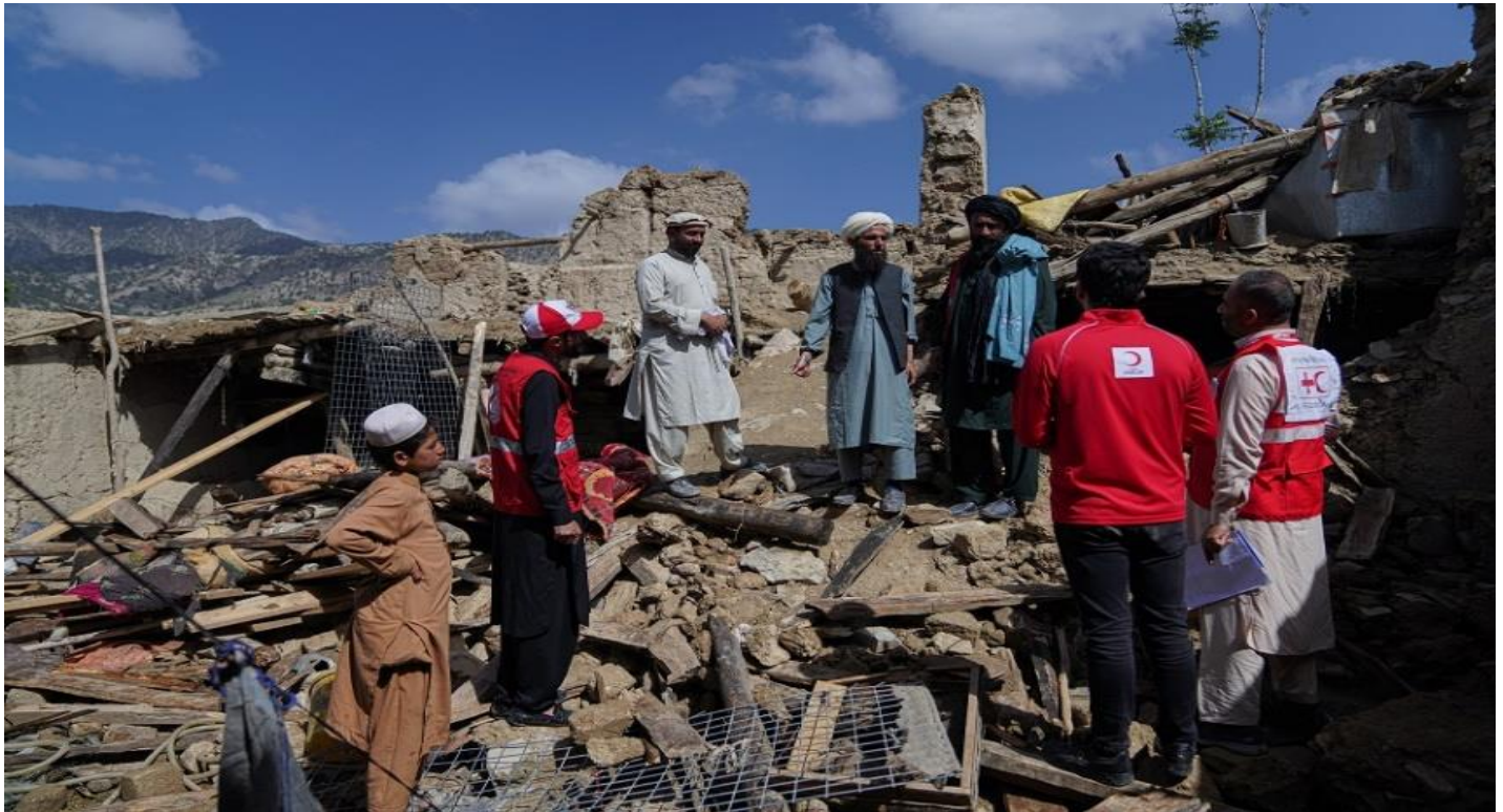
ARCS, supported by its partners, undertakes household surveys to identify priority shelter needs.

of the wider pre-existing humanitarian crises – support for repair and rebuilding interventions needs to be done alongside emergency and relief assistance. Guidance and technical support in the rebuilding of partially and fully constructed houses, and the provision of Shelter items including tarpaulins, tents, beds, carpets, mattresses with pillows, and plastic sheets were identified as part of household shelter needs of the affected population.