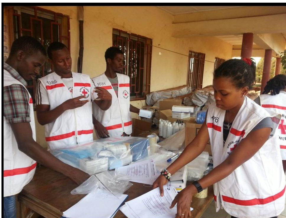
Guinea Red Cross volunteers preparing personal protection kits (PPE's) at the NS HQ in Conakry, 9 April 2014, to be despatched to Guéckédou where the French Red Cross health ERU is operational.

Responding to the confirmed outbreak of Ebola virus disease (EVD), the IFRC launched an Emergency Appeal on 4 April 2014 to support the National Society in their strategy to contribute to the reduction of morbidity and mortality through community health outreach, and social mobilization; psychosocial support. Major components of the Emergency Appela and the support to the National Society are in the form of IFRC surge capacity – a Field Assessment and Coordination Team (FACT), complemented by a Swiss Red Cross Logistics Emergency Response Unit (ERU), and a French Red Cross Health ERU. Both ERU teams are providing vital and effective support in their areas of technical expertise.