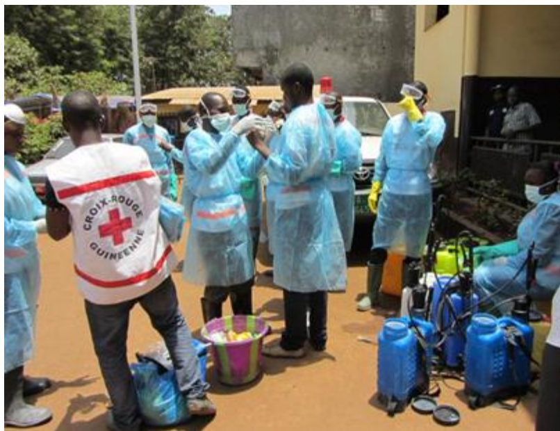
Guinea Red Cross volunteers preparing for disinfection activities

taken with figures emerging from the coordination meetings, and there continues to be a degree of confusion over discrepancies. The fast evolving and epidemiological nature of Ebola virus disease means that a fixation on numbers presents a one-dimensional aspect to the situation; the reality is that the epidemiological trend is nearly impossible to predict. This is illustrated with the figures from 17 April that indicated 190 identified cases, with reportedly 120 deaths (a case mortality rate of some 68%). Subsequently, the classification of figures were adjusted, resulting in the new figures below which are considered more accurate but which also has some discrepancies.