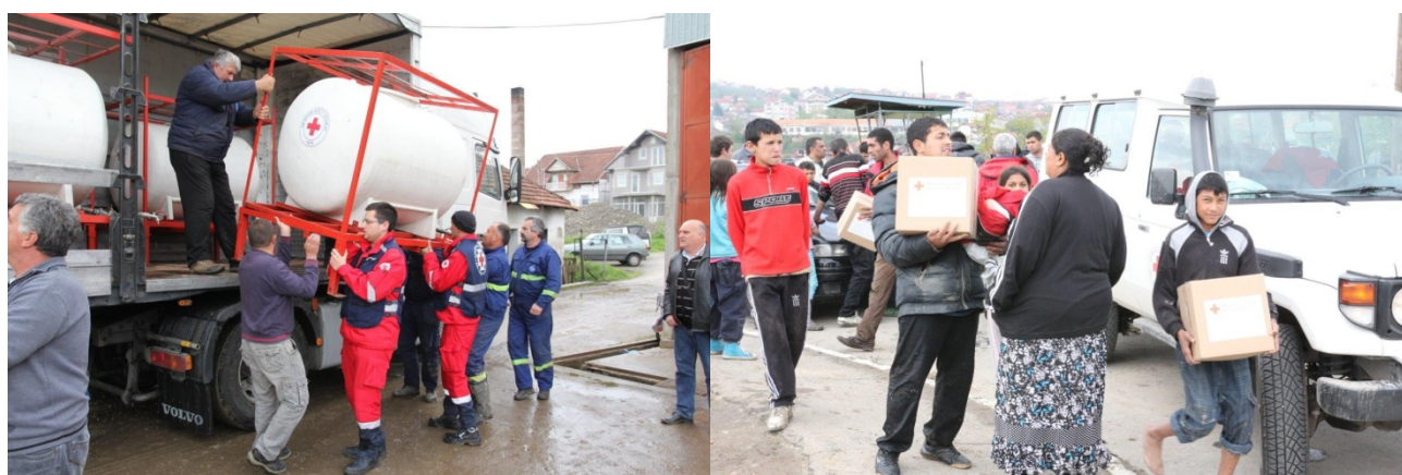
Red Cross distribution of water tanks and hygiene parcels during the flood response

In five municipalities the Red Cross of Serbia has delivered 21 water tanks (1,000 liters each) and 45 wall dryers.