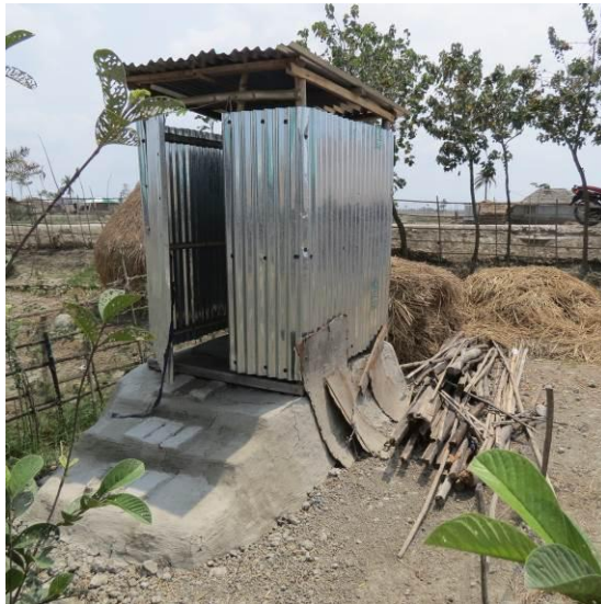
(Fig. C: Sanitary latrine with walling materials for privacy was provided to each housing beneficiary household)

were also provided to each household. Each household was given BDT 10,000 (about US$125) to buy additional materials, particularly walling materials, and pay construction workers. Household members assisted in the construction of houses and employed construction workers from the community.