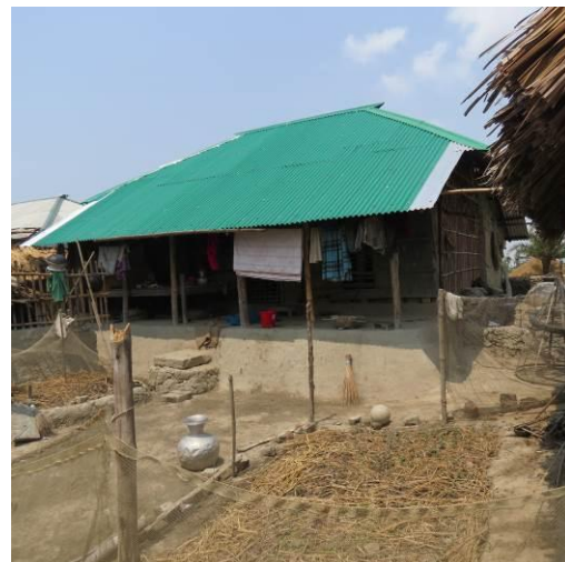
(Fig. K: Raised house plinths were built to protect from flooding)