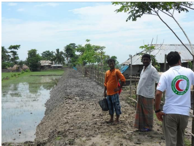
(Fig. H: Roads such as this were built through the cash-for-work program and also served as dykes)