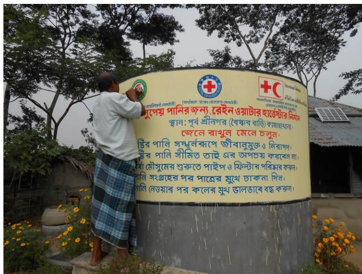
(Fig. F: Community rainwater tank)

Similarly three community toilets and bathroom consisting of six chambers (three male and three female) were built to serve the whole community (see Fig. G). Each male and female section had a bathroom chamber, latrine chamber and a children's latrine chamber (with a smaller toilet pan).