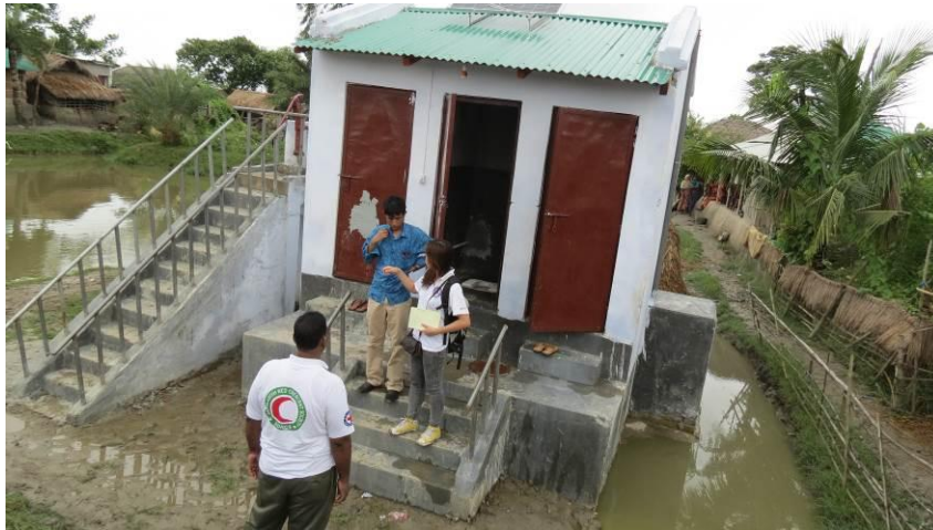
(Fig. G: Community toilet/bathroom)