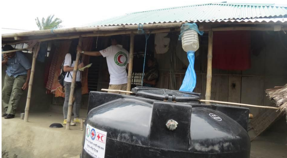
(Fig. D: 1000-litre capacity rainwater tanks were provided to housing beneficiary households)

were also provided to each household. Each household was given BDT 10,000 (about US$125) to buy additional materials, particularly walling materials, and pay construction workers. Household members assisted in the construction of houses and employed construction workers from the community.