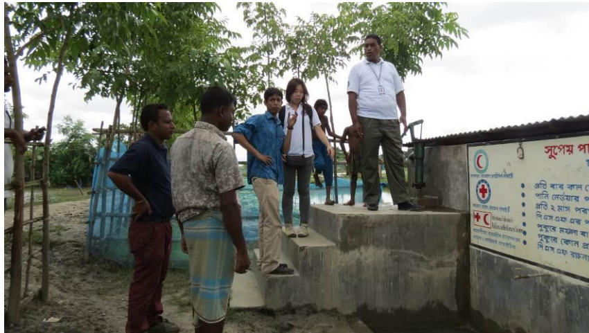
(Fig. E: New Pond Sand Filter built in the project)

level rise and consequent salinity intrusion. Therefore alternative drinking water sources including rainwater were promoted in the project. Two Pond Sand Filters (PSF) to purify rainwater collected in a pond was repaired, which had been provided by the government before the cyclone, and six new PSF was built (see Fig. E). four community rainwater tank was also built (see Fig. F). These facilities catered to the whole community beyond the 155 households that had received housing support and individual rainwater tanks.