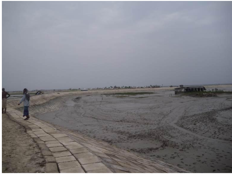
(Fig. B: A view from Dacope showing its low-lying coastal environment)