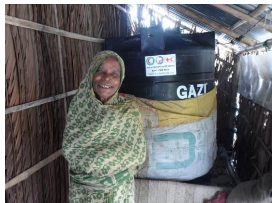
(Fig. L: This rainwater tank was brought onto the veranda to keep it safe from theft)