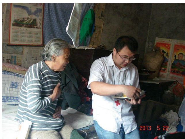
RCSC Jincheng Red Cross staff is checking the medication taken by a TB project beneficiary while conducting regular monitoring.

After the re-launching of RCSC TB programme at the end of last year, the IFRC EARD and RCSC headquarters together with Lilly Foundation/Lilly China conducted a planned monitoring trip in Changzhi and Jincheng prefectures on 14–16 January. The team randomly interviewed three drug-resistant TB patients who have suffered the disease for more than eight years but are not cured due to financial difficulties or irregular medication. The patients are encouraged to continue the proper treatment. The monitoring team observed the volunteers’ work and problem solving to ensure programme implementation. Meanwhile, the team assisted the preparation and designing of IEC materials for the publicity events organized in the upcoming World TB Day.