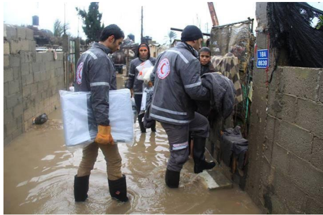
PRCS disaster response teams provide relief items to the most vulnerable families in the West Bank (PRCS)

The most affected areas were the most vulnerable ones: Bedouin communities and the communities living close to the separation wall. More than 7,562 families (49,971 persons) located in the districts of Gaza, Hebron, Jenin, Salfit, Ramallah, Tubas, Jordan Valley, Nablus, Bani Naim, Yalta and the Jerusalem area beyond the separation wall temporarily fled their houses due to floods and major damage to the infrastructure; in most cases they returned to their homes a few days after the rains stopped. The timely response by PRCS to the affected people contributed to mitigate the impact of the exceptionally heavy rains and snow.