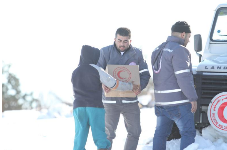
PRCS response teams provide relief items to the most vulnerable families in the West Bank

This operation is expected to be implemented in two months, and completed by 10 February 2014. In line with the Federation reporting standards, the Final Report (narrative and financial) is due 90 days after the end of the operation (by 10 May 2013).