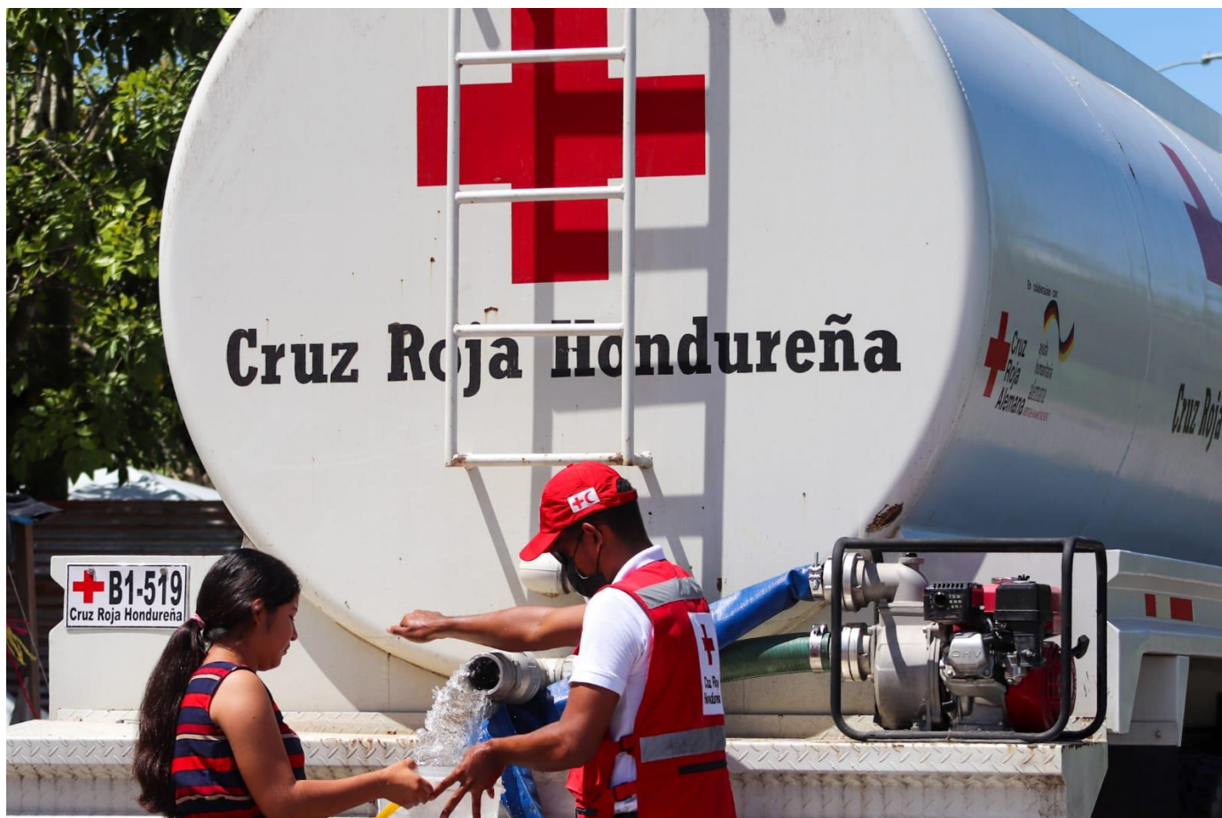
Safe water distribution in El Progreso, Yoro, 14 October 2022.