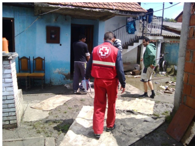
Smederevo branch mobile technical team assessment in the field with Roma communities.