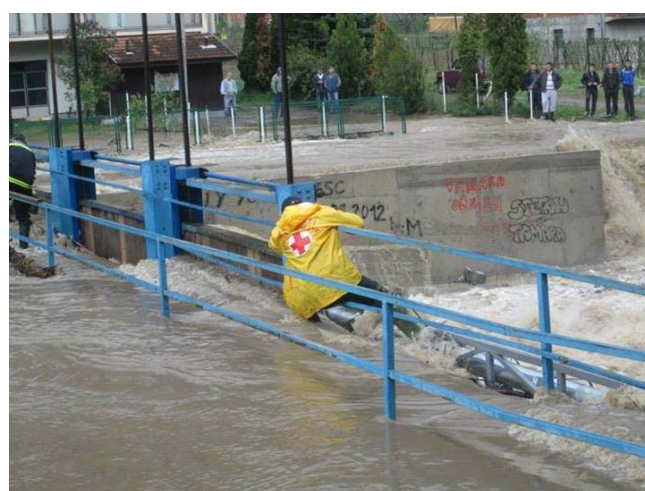
Constraints during field assessment.

The Belgrade branch of the Red Cross is helping the evacuated people in cooperation with city authorities and the City of Belgrade Emergency Management HQ by providing shelter, food distribution, clothes and shoes.