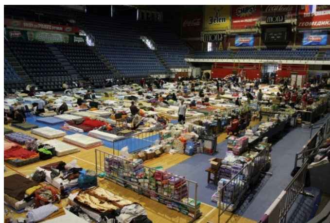
Red Cross shelter in Belgrade.

As the situation is still ongoing and areas are still under water, continued assessments will have to be carried out to have a clear picture on the real damages and needs. The possibility of launching an emergency appeal will be also explored as soon as the situation becomes clear. This will be based on detailed needs assessments and will be done in coordination with other actors. It will also reflect the possible needs of the affected people during the rehabilitation phase.