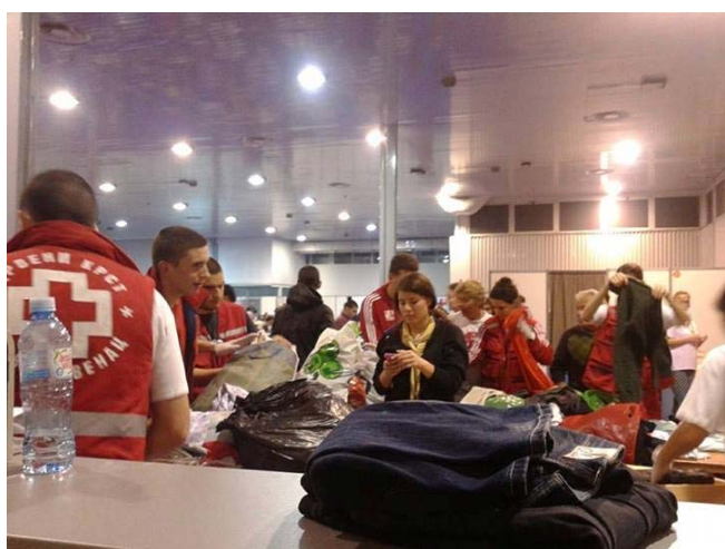
Red Cross goods collecting campaign.

Mobile technical teams are already helping people in the endangered cities where the water is receding, with the task of pumping the water out of the flooded houses and to engage wall dehumidifiers, in order to help people move back to their houses. More requests for RC mobile technical team assistance are pending. The urgent distribution of food and non-food items has been organized from the RC Disaster Management Warehouse. However, that distribution was delayed in some municipalities due to the inaccessible road infrastructure. Assistance to renew stocks of blankets, mattresses, cots, rubber boots, hygiene items, plus family parcels, cleaning kits, ready-to-eat meals and canned food, to be sent out to the evacuation points, will also be needed.