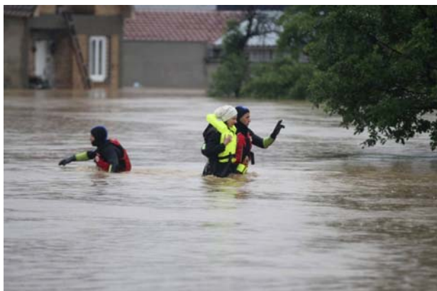
Water rescue team activities in Obrenovac municipality.