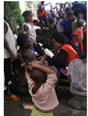
URCS volunteers offering first aid to refugees from the Democratic Republic of Congo.

URCS, with support of IFRC, launched a DREF operation for an initial period of three months, in coordination with other actors, to support up to 1,000 of the most vulnerable families. From the assessment and data gathered, it was decided to support the families with non-food item kits (which include cutlery, blankets and tarpaulins) and reach the entire affected population with hygiene promotion messages, water purification sachets and the set-up of temporary latrines in the transit center. Further support was received from Danish Red Cross that enabled the operation and also the extension of assistance to host communities and border areas besides the main support from UNHCR for Camp Management. Although the situation kept changing at almost every turn of the week, the other partners and URCS with support from UNHCR, the DREF, and Danish Red Cross (DRC) were able to provide humanitarian support to approximately 30,000 refugees in the transit camp (UNHCR Biometric Data Registration; 5/1/2014). By the 31st December, the above mentioned support and assistance from other stakeholders had forestalled any would be worsening humanitarian condition of the refugees and above all averted the occurrence of any humanitarian catastrophe in the transit center. By the end of the DREF operation, the situation had stabilized and the reception center had approximately 2,000 refugees who were selected for transfer to the settlement.