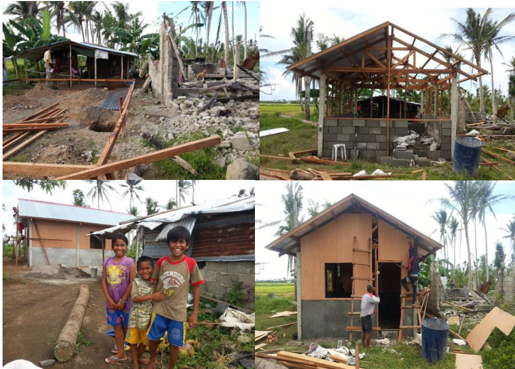
(Clockwise from the top left) The building of core shelter housing in Tabontabon began in April and now continues, expanding across several municipalities in Leyte. Consisting of both timber and concrete, these shelters will provide more resilient housing for families in the upcoming storm season this year.