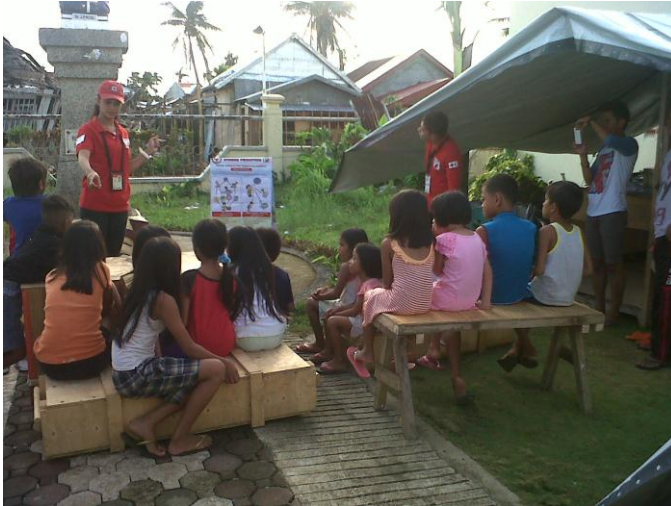
Sitting on makeshift box seats and benches, children listen as a Red Cross volunteer teaches them good hygiene practices, such as how to prevent the spread of germs when sneezing, and when it is essential to wash their hands. Children constitute a large portion of the population internally displaced by Typhoon Haiyan.