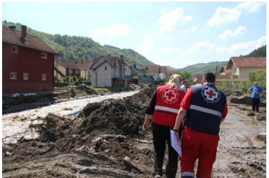
Field assessment by RCS in Krupanj.

The Red Cross of Serbia (RCS) – as a member of the Municipal Emergency Headquarters – has been providing humanitarian assistance by covering urgent needs through its local branches to all affected population eligible to receive humanitarian aid.