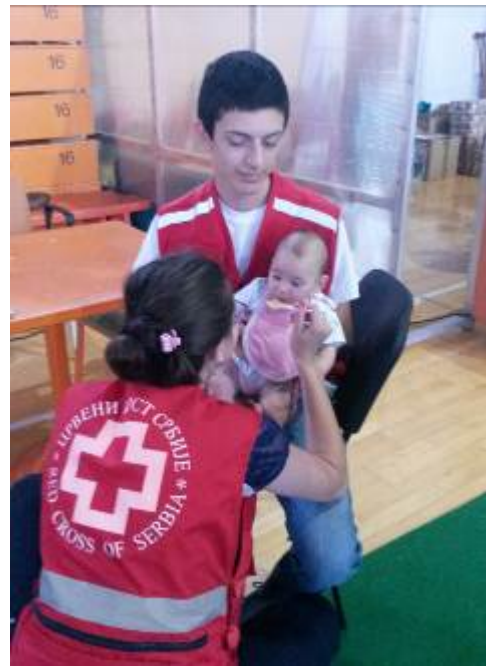
RC volunteers feeding an infant at the transition centre in Lazarevac.

In other parts of Serbia, excluding Obrenovac, there are 336 persons in collective centres and 5,331 persons in private housing establishments.