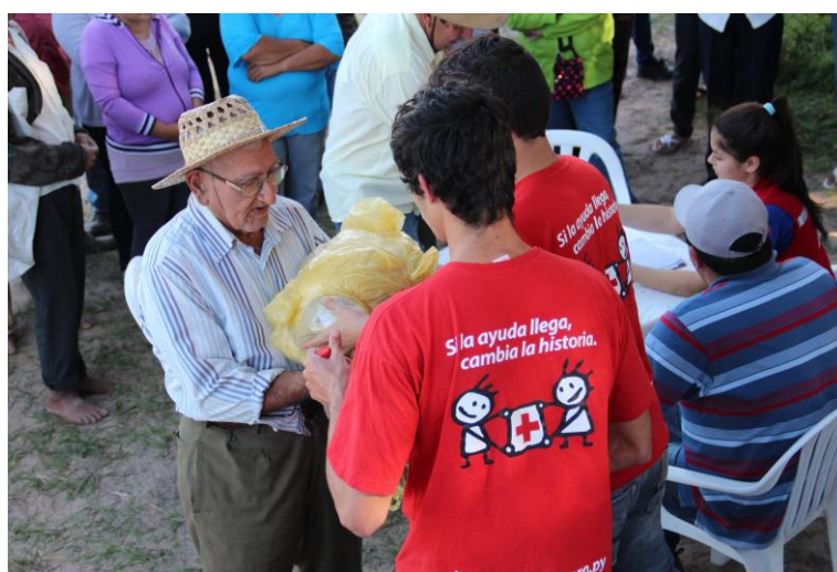
Volunteers of the Paraguayan Red Cross (PRC) distributing relief items to affected families.

The most recent rains registered in the upper basin of the Iguazú river have led to the overflowing of its riverbed and the subsequent increase of water levels in the Paraná river. This has led to the increase in the amount of water in the reservoir of the Itaipú and Yacyreta dams, which has required both dams to increase their water flow which in some cases has reached between 22,000 m 3 /s and 43,000 m 3 /s. As a consequence, the impact has been extreme for the riverside populations located in Alto Paraná, Misiones and Ñeembucú. Located in the southwest of the country, Ñeembucú has experienced the highest impact due to the increase of water levels of the Paraná river, with the following towns being severely affected by the floods: Paso de Patria, Villabin, Humaitá, Cerrito, Mayor Martinez and General Diaz, as well as Ayolas in the Misiones department.