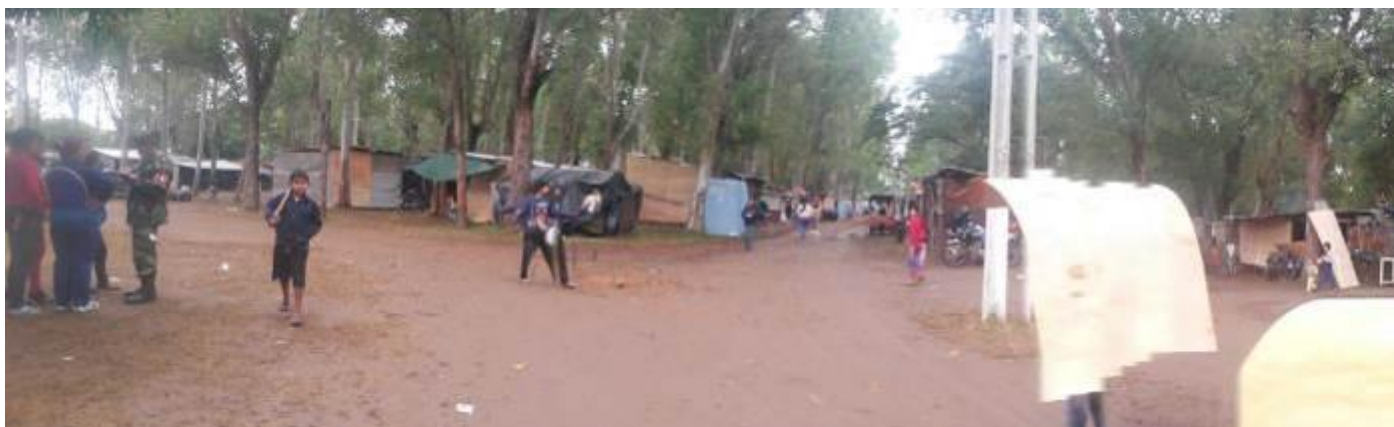
Affected families living in unplanned camps that are not fulfilling minimum standards.

As Asuncion is an urban centre, most households are built with concrete blocks and wood. Housing damage has been minimal. A full damage assessment remains to be completed since homes remain under water. In some areas, water is expected to remain in place for up to two months, which will extend the time spent in shelters. There are two scenarios in the Asunción camps: 1. The Armed Forces have used military facilities for shelters and 2. Emergency-affected households have set up tents on sidewalks and streets. In the military-run shelters, families receive more attention and have at least 6x4 metres of space per family. On the street, these spaces are approximately 1.5 metres. There are approximately 1,500 families in the military facilities, which have electricity, water, community toilets, playgrounds and trash disposal. The government has provided these people with tin sheets for a roof, wood, plastic sheeting, mattresses and food.