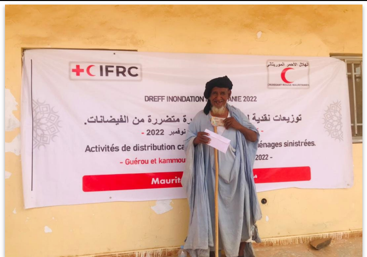
Picture: Immediate assistance to basic needs through CVA. Guerou

Mauritanian Red Crescent (MRC) has experienced delays in the implementation of the DREF operation activities due to delays in receiving the funds and difficulties with the procurement process of shelters and NFI kits (one of the main actions of this appeal), challenges that have prevented the MRC from conducting all DREF activities within the initially planned period.