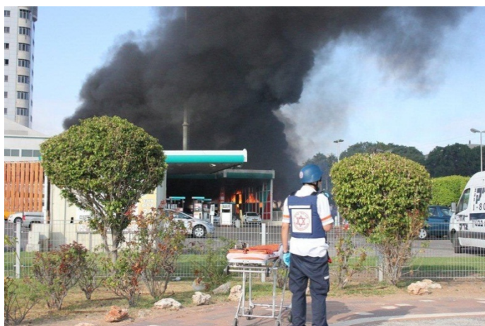
MDA paramedic at the scene of a missile strike in the city of Ashdod, where one person suffered critical injuries and 8 others were injured.

MDA is preparing for the following scenarios during this current escalation: