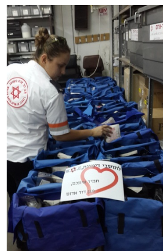
First Aid Kits to be distributed in remote communities being prepared in MDA central warehouse

The city of Dimona, with a population of 35,000 people, has been chosen for this health care activity because it is located as far as 45 km from the nearest hospital (Beer Sheba hospital). The city has been targeted by rockets several times over the past few days.