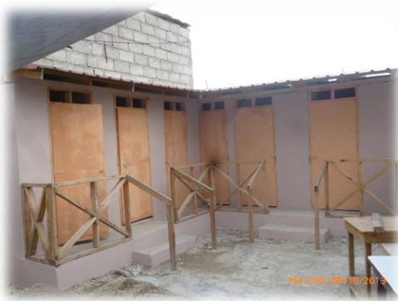
Before and after photos: repaired toilets in Ecole Eden Louis in Delmas 30.