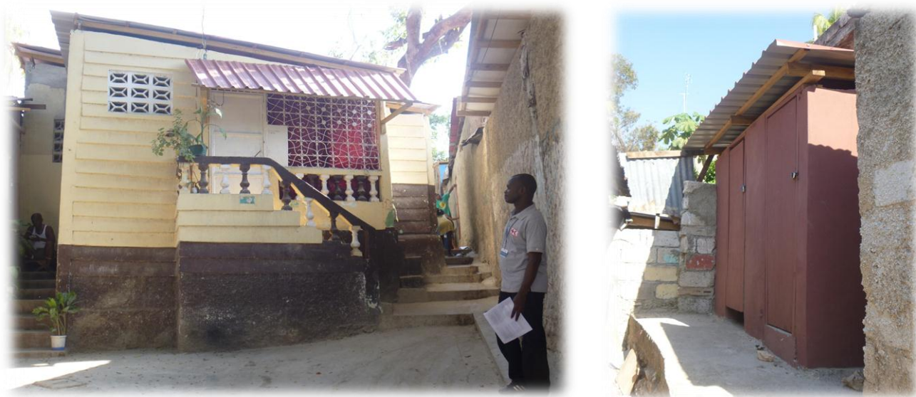
House and toilet unit retrofitted in Carrefour Feuilles.

Progress: The house repair and retrofit component of the INA programme ended in Delmas 30 and Carrefour Feuilles sites at the end of December 2013, reaching 215 households and 168 houses. Construction works represented an opportunity for short-term job creation in the two neighbourhoods as local masons, carpenters, welders and non-skilled labour, were recruited through a community bidding process and on a rotational basis. Block representatives were involved in the recruitment process by spreading the word in the area and circulating work advertisements produced by the INA team, by publicizing it in community gatherings or meetings and on public notice boards, and by collecting applications for the job interviews to be conducted with the INA technical teams. The selection process of the local workforce was led by the INA team and all construction units worked under IFRC's technical supervision.