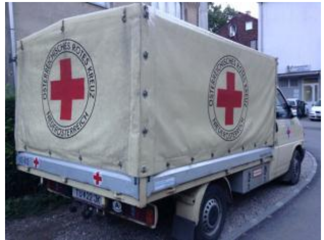
Bilateral WatSan support from the Austrian Red Cross arrived in Brcko District.

Swiss Red Cross and Austrian Red Cross have mobilized substantial support for RCSBiH to conduct a programme to support livelihoods recovery and the rehabilitation of houses by using cash transfer methodology.