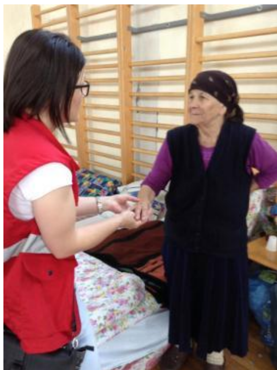
RCSBiH volunteer in Brcko District offers support to one of the collective centre's residents.