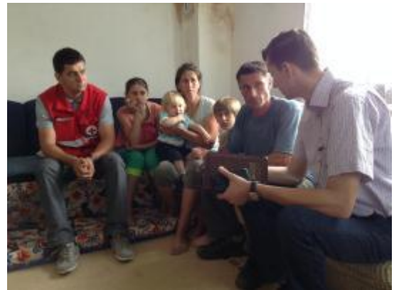
RCSBiH volunteer and IFRC operations team in Brcko District visiting beneficiaries.