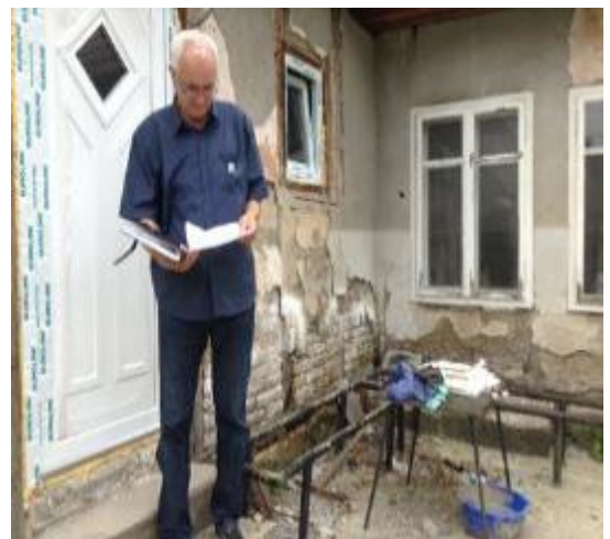
RCSBiH Secretary in Maglaj on a site visit cross-checking and verifying the beneficiary lists for the planned Cash Transfer Program (CTP)

The IFRC aims to undertake a revision of the Emergency Appeal, which will include all bilateral contributions received by the RCSBiH from donors in order to present an overall picture of the support received by the BiH National Society at this point of time.