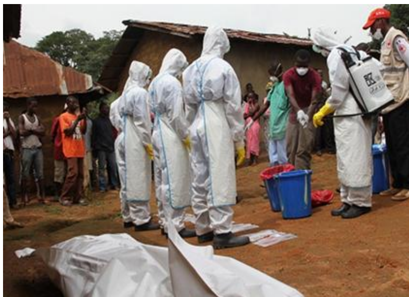
SLRCS dead body management team completing the disinfection of an Ebola affected house and corpse as well as in the process of PPE removal after a community burial in Sandiaru, Luawa Chiefdom, Kailahun on 17 July 2014.

This operations update provides progress on the activities implemented against the revised emergency plan of action (EPOA) for the main operational areas including surveillance case identification and contact management, case management (including dead body management), psychosocial support services (PSS), regional preparedness and response and organisational risk.