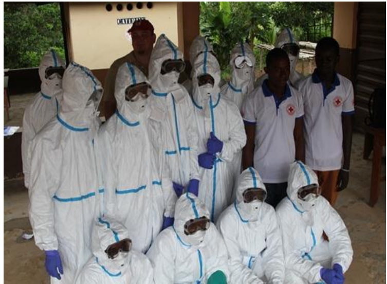
Dead body management team on training at the SLRCS CAR Centre in Kailahun on 11 July 2014.

The SLRCS in close collaboration and in partnership with IFRC, MSF and the Ministry of Health and Sanitation/WHO, Save the Children, is highly engaged in community awareness, service delivery and activities coordination. The National Society continues to benefit and learn from the good working relationships and partnerships with these stakeholders. The operation also enjoys the effective coordination between the SLRCS branches and headquarters and partners. The Kailahun Red Cross Branch has over 700 volunteers out of which only 142 volunteers supported by 11 staff are actively involved in the Ebola related in the district. There is political will/commitment from the Government, politicians, religious leaders of different faith-based and women's groups etc. towards the fight of the disease.