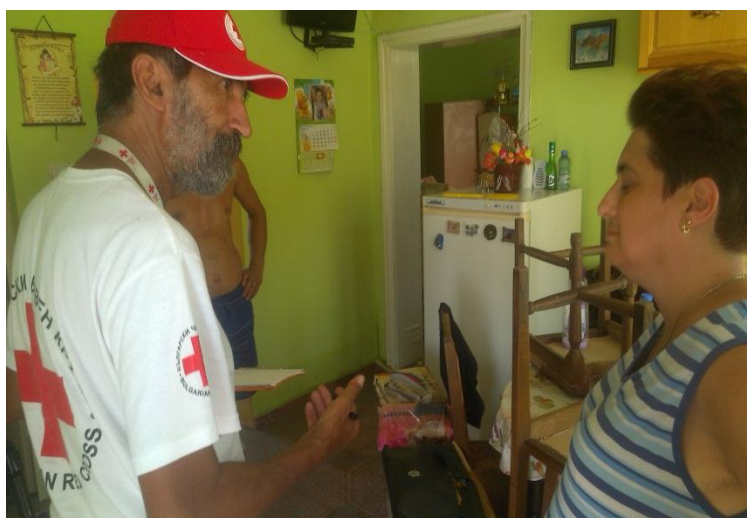
Needs assessment carried out by the National Disaster Response Team

Although most of the water covering Mizia has been drained, the situation is still critical. Tap water is contaminated and unfit for drinking or even washing. Electricity is still cut in some parts of Mizia (the town most affected by the floods). Rotting carcasses of dead animals are increasing the risk of diseases, and crippled buildings are also a threat to the population.