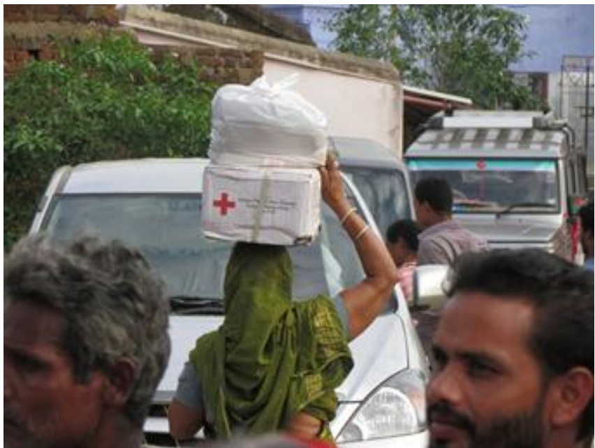
IRCS, through its pool of trained, volunteers, has reached the needs of the affected people in Odisha and Andhra Pradesh.

This outcome is achieved and activities have completed. The distribution of family packs in Odisha and Andhra Pradesh were completed in January 2014 and was reported in detail in DREF update no.3 . The planned lesson learnt workshop did not happen; however the experience and lessons learnt, mainly gaps identified in this operation, were shared through several rounds of discussion with IRCS NHQ and state branches.