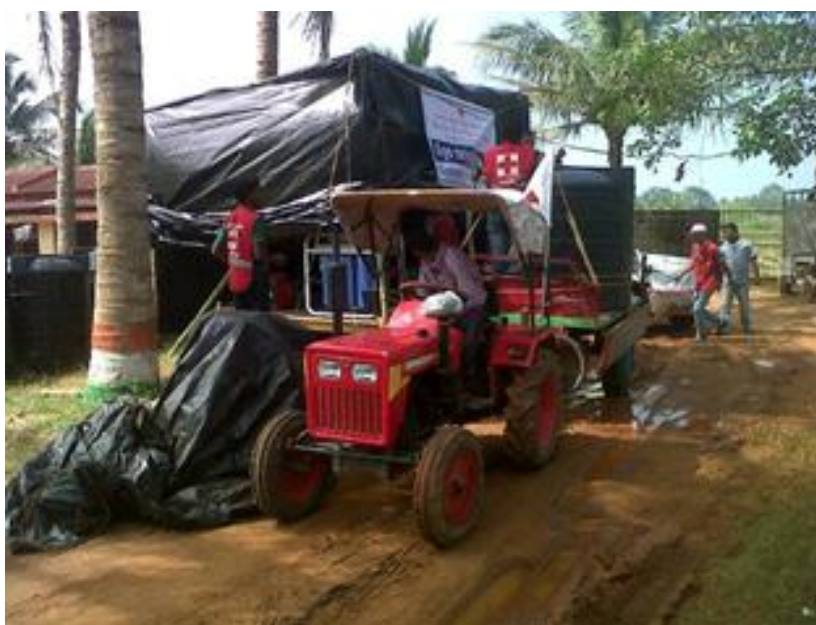
In October 2013, IRCS catered to the WASH needs of the Cyclone Phailin affected villages.

IRCS with its enthusiastic volunteers in Odisha and Andhra Pradesh was involved with communities, since the early warning was issued. IRCS volunteers and members were key to ensure that the relief supplies reach the most vulnerable people and responding the disaster. They delivered non-food items (NFIs) during the relief operation, provided treated drinking water and promoted hygiene practices in the affected communities and helped various donors to assist people whose houses were damaged to restore better living condition, in a participatory manner.