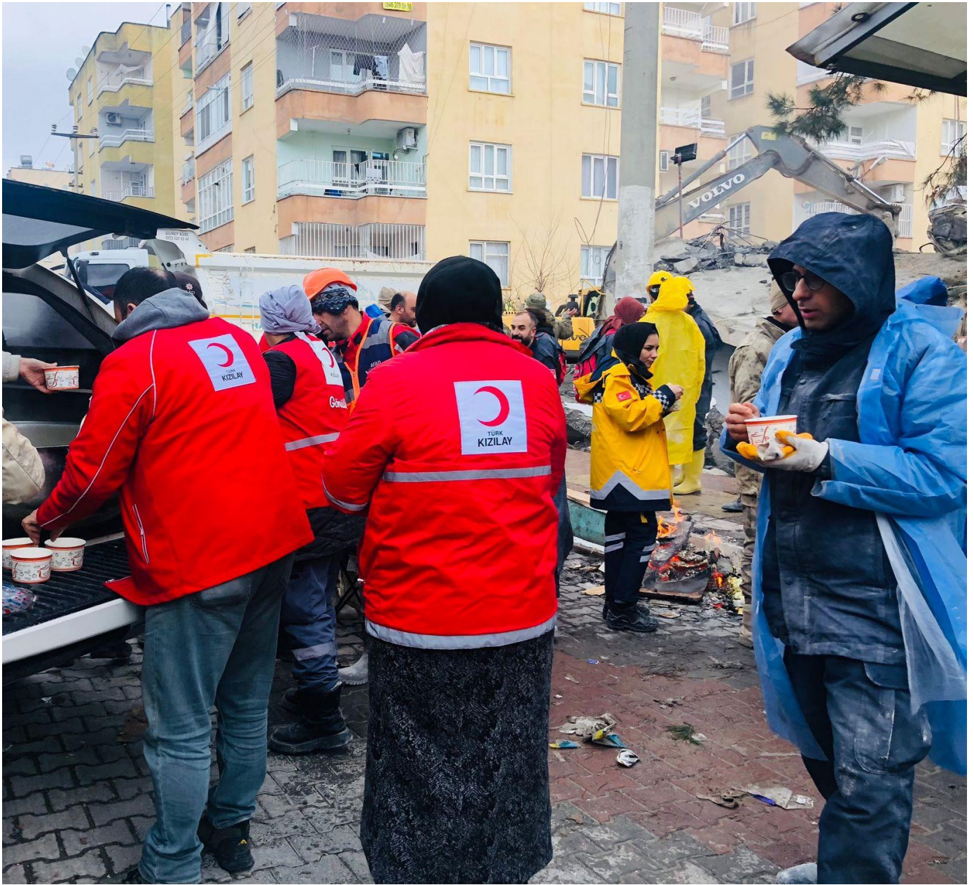
Turkish Red Crescent teams urgently responding to the needs in the earthquake affected areas