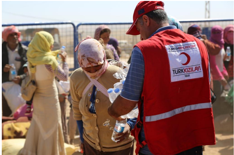
One of the most urgent relief actions in Suruc was providing people with drinking water upon arrival.

The TRC operation has been relying on own resources and the support of Red Cross and Red Crescent Movement Partners, as well as UN partners, Governments and international humanitarian organizations. Additional funds are needed in order to cope with the emergency situation that aggravates needs for the long term support that TRC is providing in the camps.