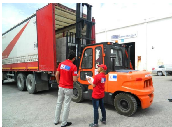
The acquisition of a forklift has improved the TRC logistic capacity of the operation.

The process of hiring English speaking finance officers for the operation and identifying psychosocial workers and instructors for the community centre is to be completed by the end of October 2014.