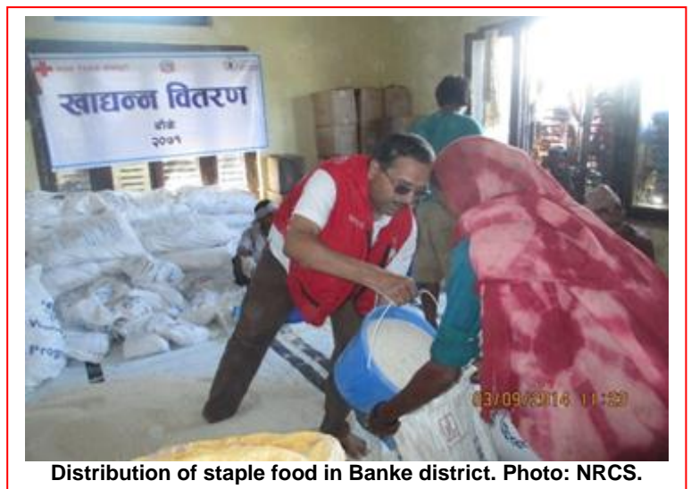
Distribution of staple food in Banke district.

NRCS has mobilized over 1,200 volunteers for assessment, and for distribution of NFRI and WatSan/HP materials.