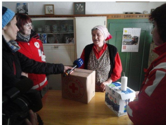
Red Cross volunteers delivering food parcels to an affected family in Cerknica.