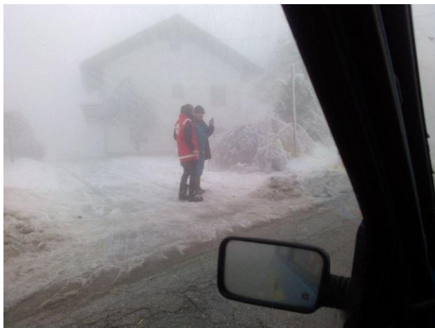
Slovenian RC volunteers conducting needs assessment and delivering aid (Postojna area)