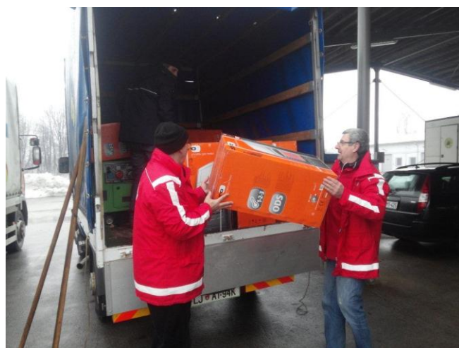
Distribution of gas heaters from the RC national logistic warehouse to the affected local branches.

A week after the disaster had stricken, there were still 30,000 people without electric power. Therefore all efforts of the Slovenian Civil Protection, as well as of the Slovenian Red Cross, were made to deploy the greatest possible number of generators. In some areas the restoration of electrical wiring took weeks, even months. In Postojna area electric power supply was ensured through generators for the following three months, before all reparation works were done