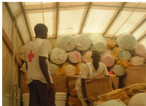
Cameroon Red Cross volunteers offloading operation material in Bourha, Far North Region of Cameroon.

The DREF operation was intended to directly support approx. 10 per cent (100,439) of the affected population of the 1,004,398 people in eight districts (Bourha, Goulfey, Hina, Kosa, Kousseri, Mogode Mokolo and Roua), which had been initially identified by the CRC, as part of the six affected Divisions.