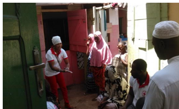
GRCS volunteers demonstrate hand washing during social mobilization activities.

In total, 200 GRCS volunteers (160 from Greater Accra region; and 40 from Eastern Region) have received one-day training on cholera outbreak management using the Epidemic Control for Volunteers (ECV) methodology. As of this Operations Update, the volunteers have reached 104,769 people with social mobilization activities, and distributed 30,000 information, education and communication (IEC) materials on cholera prevention and control. Social mobilization has been complemented by radio awareness campaign broadcasted on numerous TV and radio stations countrywide in Ghana.