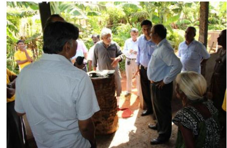
Government of India monitoring team visits Kurumpasiddy, Tellipallai.

The RC PCRP technical team members provide regular support to beneficiaries ensuring the use of quality construction materials, technical advice and supervision of the entire construction phase to produce quality and safe houses. The construction of houses is being closely monitored by the monitoring officers with periodic visits and guidance from the senior management and other operation team members. RC PCRP also receives support, guidance and advice from technical departments in Delhi, Kuala Lumpur and Geneva and from the Partner National Societies (PNSs) on a regular basis. Moreover, monitoring teams from the Government of India visit periodically to inspect progress of construction. During the reporting period (in July 2014), a team of seven members from the Ministry of External Affairs, India visited the IHP areas in Jaffna to inspect progress.