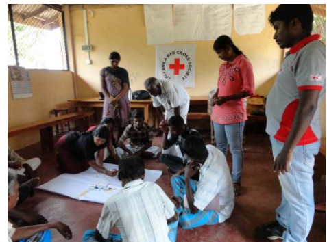
An integrated community assessment conducted in Kopay, Jaffna.

Household level water and sanitation activities (construction/repairing of household toilets and wells) are being implemented in conjunction with housing construction. The priority is given to the sanitation component (construction of toilets) and if that is already been addressed, the funds are then used for the improvements of water supply; including construction and repairing of individual household wells and provision of water supply for individual use. Of those 19,259 families in the programme under this appeal, 8,298 completed construction/repair toilets and 8,944 toilets are under construction as of 31 October 2014. The rest of the families will commence work on household toilets upon selection and fund transfer.