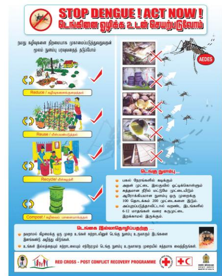
Dengue awareness poster