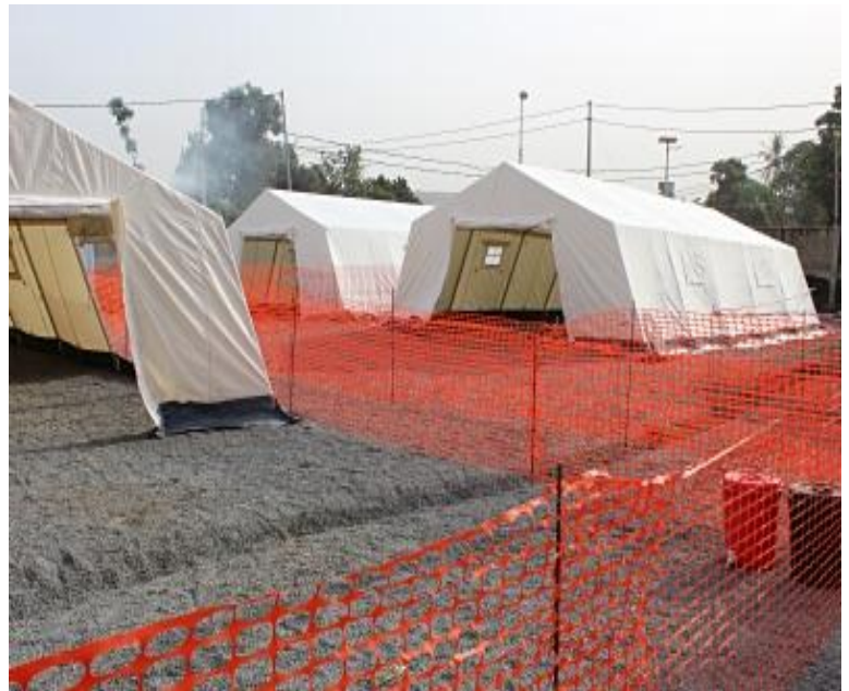
As suspected Ebola cases continue to spike at an alarming rate in Kono district Sierra Leone, a rapid response team has built a transit centre on the premises of the local hospital to separate Ebola patients from non-Ebola patients.

Five emergency appeals were launched to combat Ebola Virus Disease (EVD) outbreaks in Guinea, Liberia, Sierra Leone, Nigeria and Senegal. The appeals employ a 5 pillar approach spelled out in an Ebola strategic framework, comprising: (1) Beneficiary Communication and Social Mobilization; (2) Contact Tracing and Surveillance; (3) Psychosocial Support; (4) Case Management; and (5) Safe and Dignified Burials (SDB) and Disinfection. An additional coordination appeal was launched to accommodate multi-country support needs. Smaller preparedness and response operations were financed under its Disaster Response Emergency Fund (DREF) in Mali, Cote d'Ivoire, Cameroon, Togo, Benin, Central African Republic, Chad, Gambia, Kenya and Guinea Bissau and Ethiopia, making 16 countries in Africa that have launched emergency operations relating to this outbreak. 2