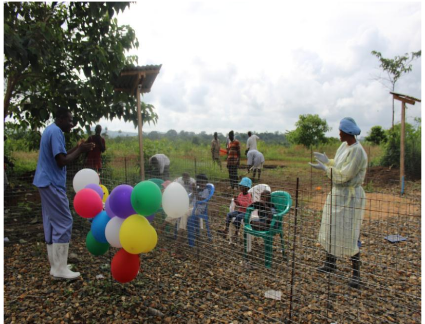
Five children are hosted in an isolation unit at the Kenema treatment centre known as the kindergarten. During the 21 day quarantine period, staff at the treatment centre teach them new songs to entertain them.

Statistics show that Ebola incidence is slowing down. Despite encouraging developments, the end of the epidemic will not happen on its own. Vigilance will be required in case management, surveillance and contact tracing to get to zero cases and stay there during the 42 day Ebola surveillance period before countries can be declared Ebola-free. Until then, any one mismanaged case can cause a resurgence.